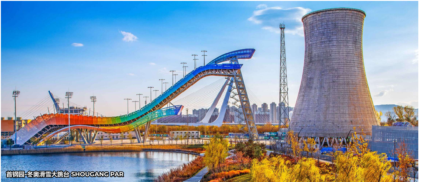
首钢园-冬奥滑雪大跳台 SHOU GANG PAR