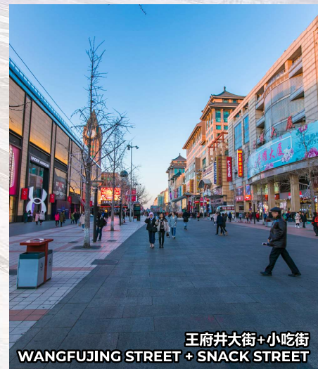
王府井大街+小吃街 WANGFUJING STREET + SNACK STREET