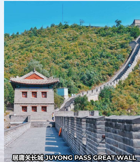
居庸关长城 JUYONG PASS GREAT WALL

Proceed to the airport for your flight back to Malaysia.