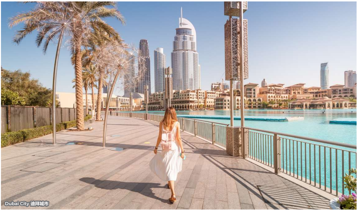
Dubai City 迪拜城市