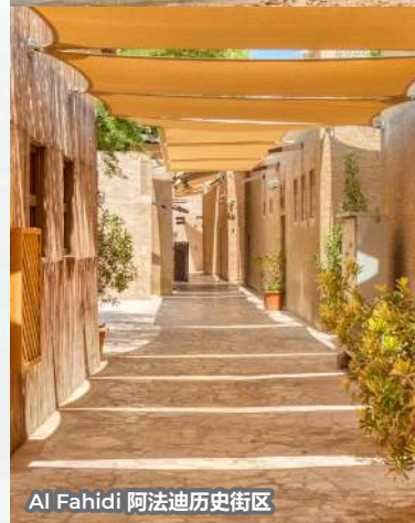
Al Fahidi 阿法迪历史街区