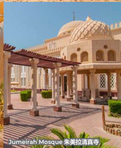
Jumeirah Mosque 朱美拉清真寺