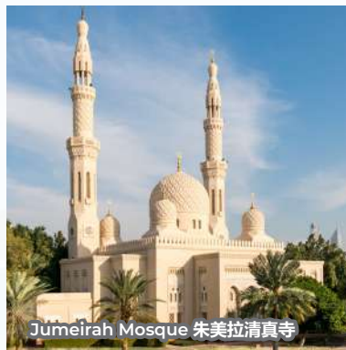
Jumeirah Mosque 朱美拉清真寺