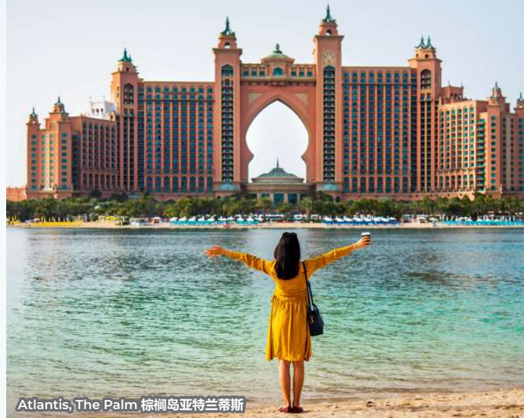
Atlantis, The Palm 棕榈岛亚特兰蒂斯