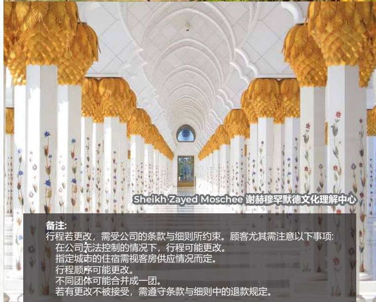
Sheikh Zayed Moschee 谢赫穆罕默德文化理解中心