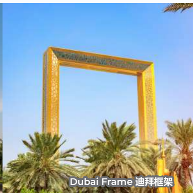
Dubai Frame 迪拜框架