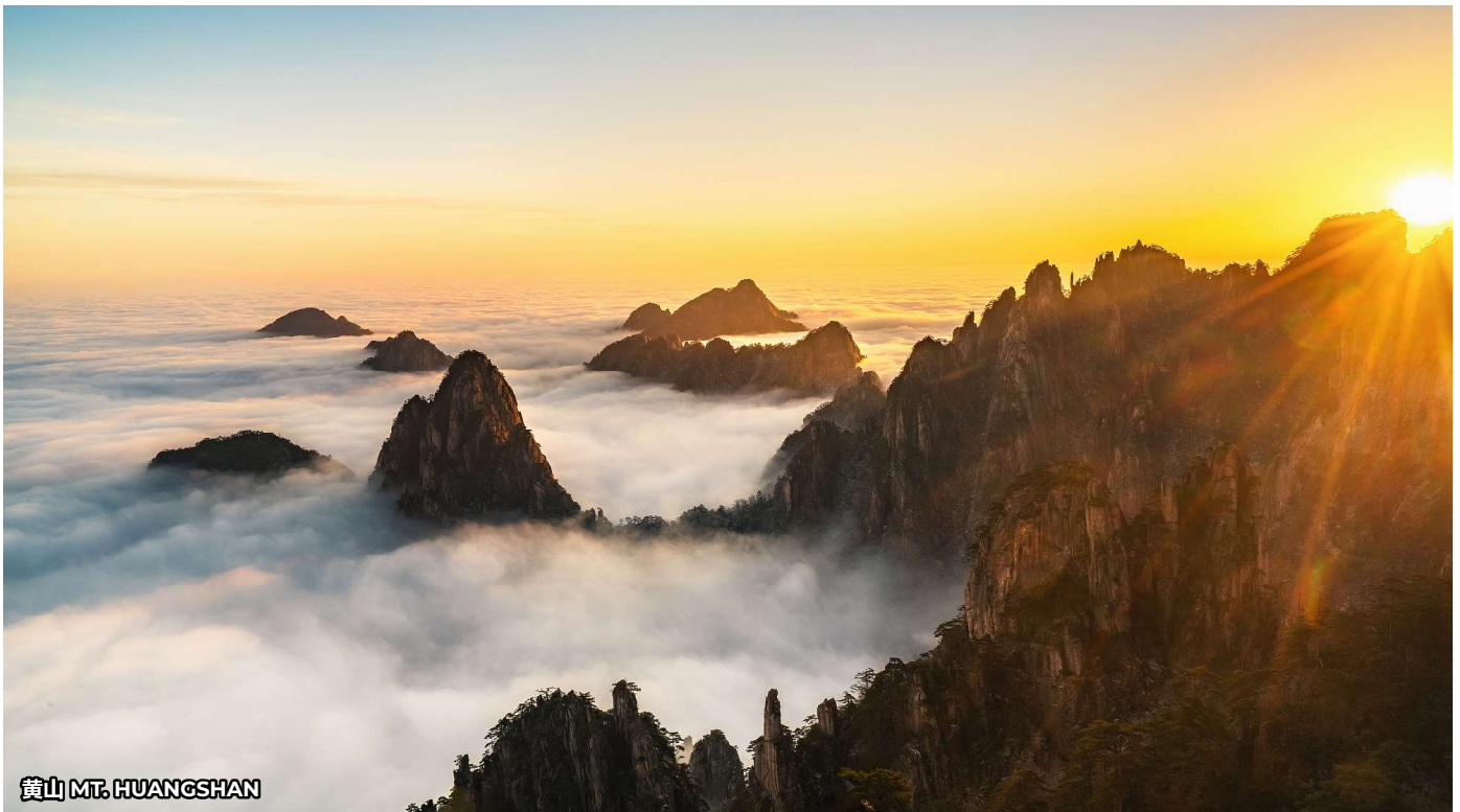
黄山 MT. HUANGSHAN