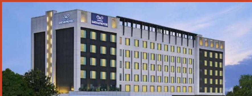
CRYSTAL SAROVAR PREMIERE