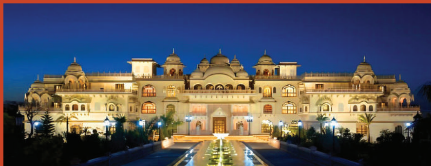
LUXURY - SHIV VILAS PALACE RESORT 皇宫酒店