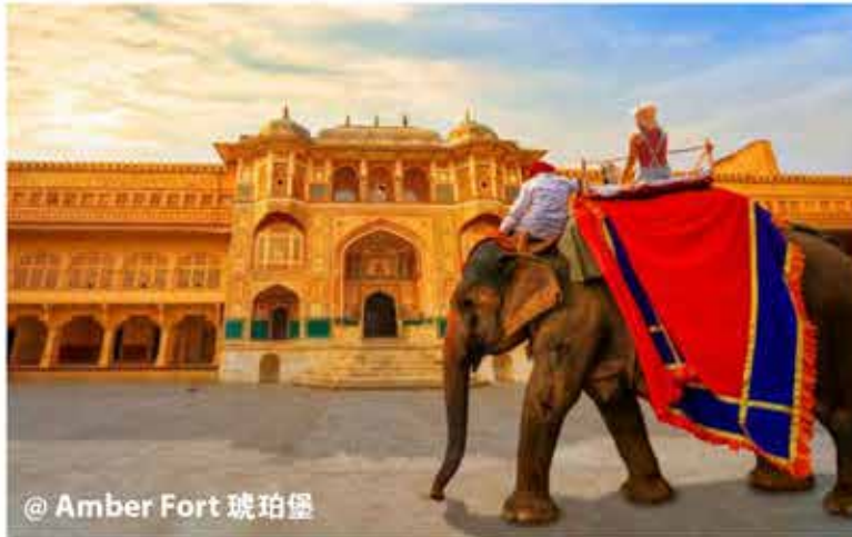
@ Amber Fort 琥珀堡