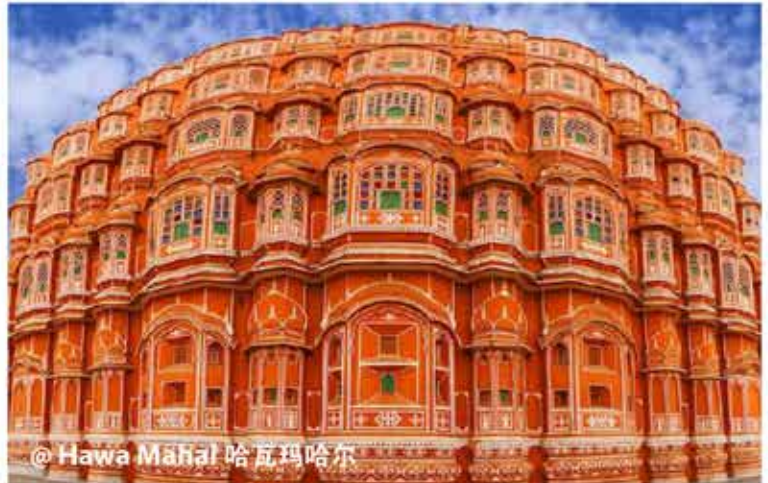
@ Hawa Mahal 哈瓦玛哈尔