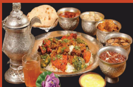
· KASHMIRI CUISINE 克什米尔料理