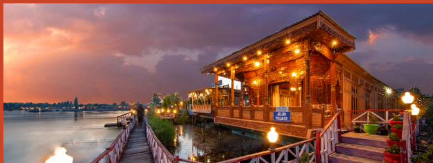
PREMIUM KOLU HOUSEBOAT 优质船屋