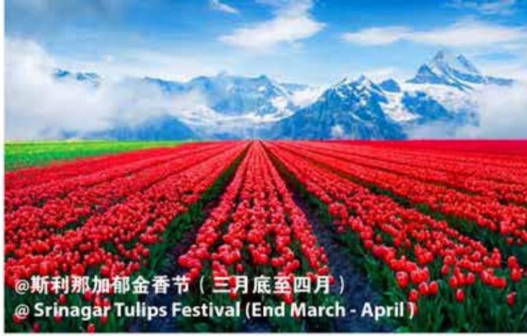
@斯利那加郁金香节 (三月底至四月) @ Srinagar Tulips Festival (End March - April)