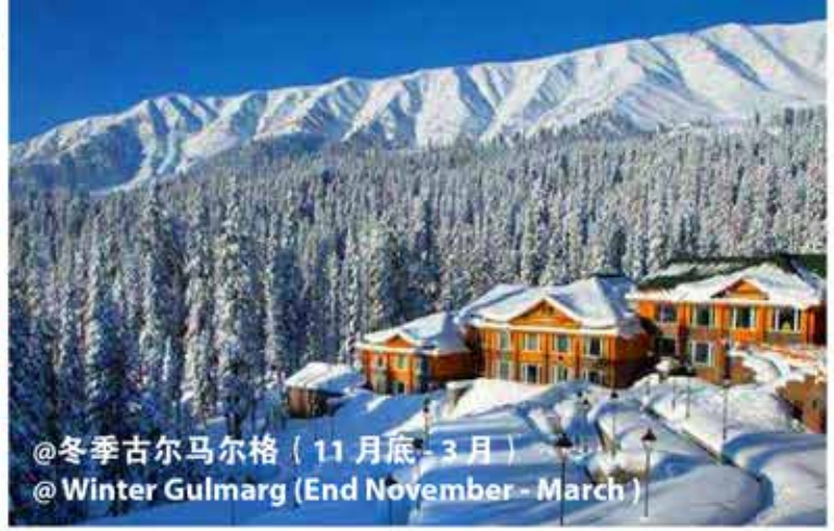
@冬季古尔马尔格 (11月底-3月) @ Winter Gulmarg (End November - March)