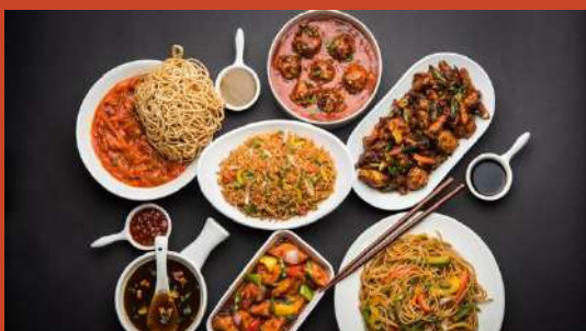
· CHINESE CUISINE 中式料理