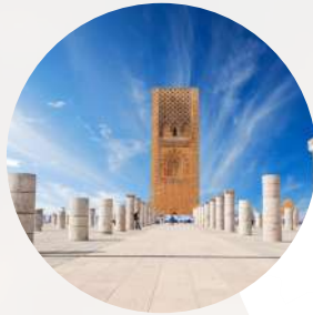
Hassan Tower 哈桑塔

Hassan Tower or Tour Hassan is the minaret of an incomplete mosque in Rabat, Morocco. It was commissioned by Abu Yusuf Yaqub al-Mansur, the third Caliph of the Almohad Caliphate, near the end of the 12th century.