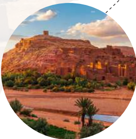
Ait Benhaddou 阿伊特本哈特

The Todgha Gorges are a series of limestone river canyons, or wadi, in the eastern part of the High Atlas Mountains in Morocco, near the town of Tinerhir. Both the Todgha and neighbouring Dades Rivers are responsible for carving out these deep cliff-sided canyons, on their final 40 kilometres through the mountains.