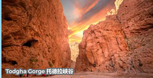
Todgha Gorge 托德拉峡谷