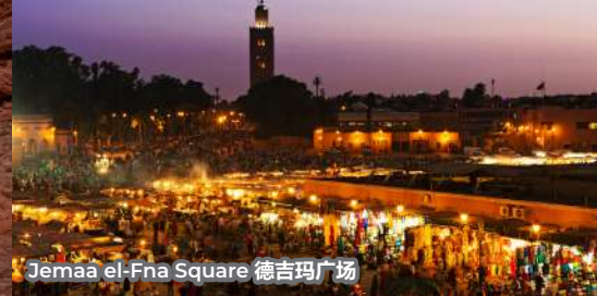
Jemaa el-Fna Square 德吉玛广场