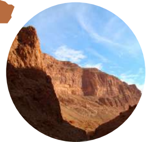
Todgha Gorge 托德拉峡谷

The Todgha Gorges are a series of limestone river canyons, or wadi, in the eastern part of the High Atlas Mountains in Morocco, near the town of Tinerhir. Both the Todgha and neighbouring Dades Rivers are responsible for carving out these deep cliff-sided canyons, on their final 40 kilometres through the mountains.