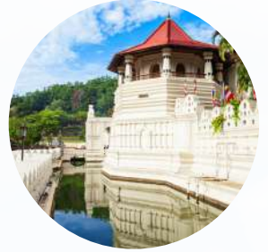
Temple of the Sacred Tooth Relic 佛牙寺

Dambulla cave temple also known as the Golden Temple of Dambulla is a World Heritage Site in Sri Lanka, situated in the central part of the country.