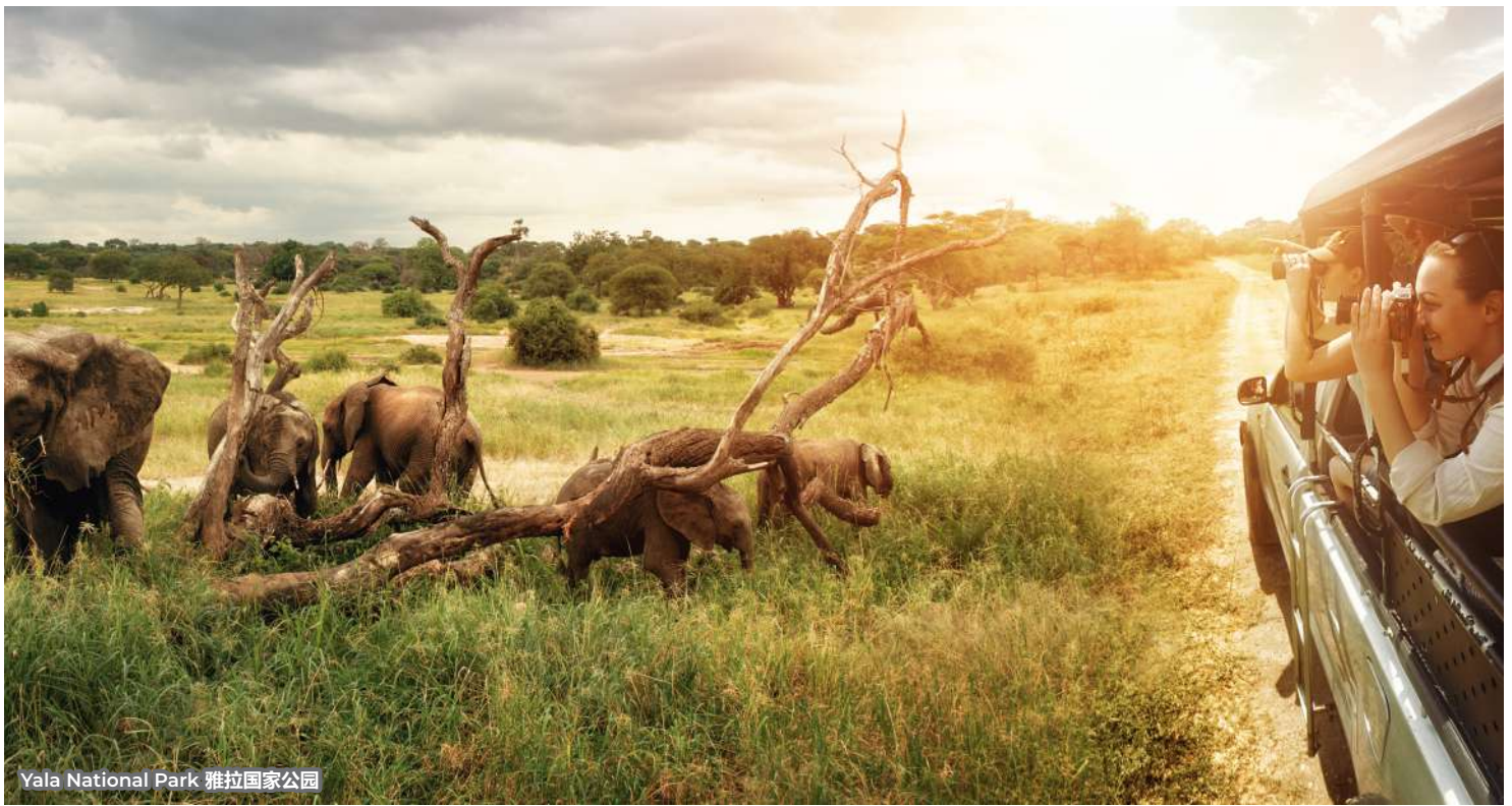
Yala National Park 雅拉国家公园