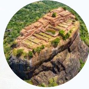
Sigiriya Rock Fortress 锡吉里耶古城

Sigiriya or Sinhagiri is an ancient rock fortress located in the northern Matale District near the town of Dambulla in the Central Province, Sri Lanka.