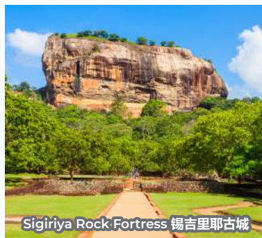
Sigiriya Rock Fortress 锡吉里耶古城