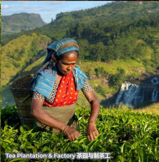
Tea Plantation & Factory 茶园与制茶工