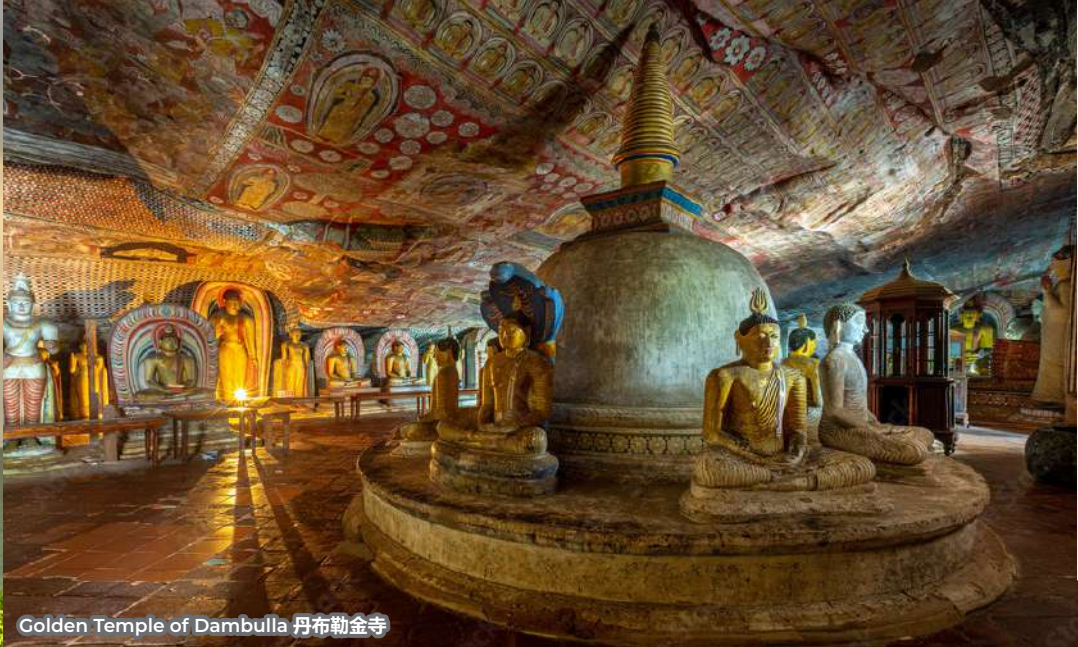
Golden Temple of Dambulla 丹布勒金寺