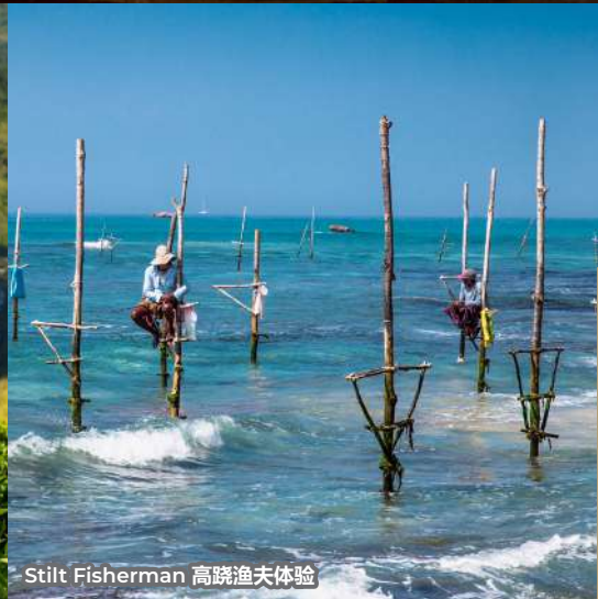
Stilt Fisherman 高跷渔夫体验