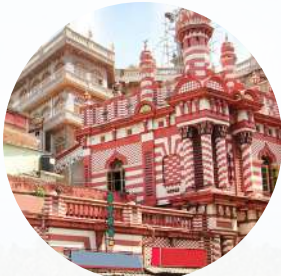
Colombo Fort 科伦坡城堡区

Fort (Colombo) is the central business district of Colombo in Sri Lanka. It is the financial district of Colombo and the location of the Colombo Stock Exchange and the World Trade Centre of Colombo from which the CSE operates. It is also the location of the Bank of Ceylon headquarters.