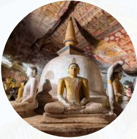
Golden Temple of Dambulla 丹布勒金寺

Sigiriya or Sinhagiri is an ancient rock fortress located in the northern Matale District near the town of Dambulla in the Central Province, Sri Lanka.