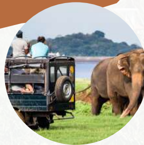
Jeep Safari at Yala National Park 雅拉国家公园吉普车探险

Fort (Colombo) is the central business district of Colombo in Sri Lanka. It is the financial district of Colombo and the location of the Colombo Stock Exchange and the World Trade Centre of Colombo from which the CSE operates. It is also the location of the Bank of Ceylon headquarters.