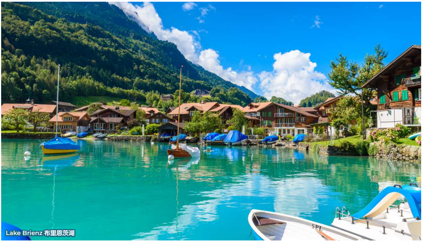
Lake Brienz 布里恩茨湖