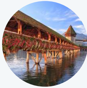
Chapel Bridge 卡贝尔桥

A humane habitat for bears, promoting natural behaviors in a forested setting. Visitors can observe the bears from platforms, supporting conservation and animal welfare in Bern.