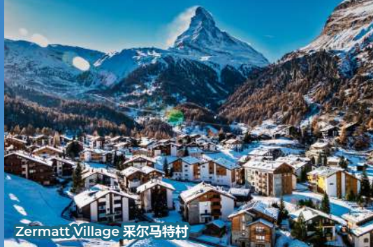
Zermatt Village 采尔马特村