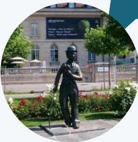
Charlie Chaplin Statue 查理卓别林雕像

Charlie Chaplin Statue : The iconic comedian in a casual pose with a cane. Located along Lake Geneva's promenade, it honors Chaplin's legacy in the world of cinema.