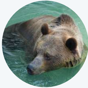
Bern Bear Park 伯尔尼熊公园

A humane habitat for bears, promoting natural behaviors in a forested setting. Visitors can observe the bears from platforms, supporting conservation and animal welfare in Bern.