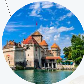
Chillon Castle 西庸城堡

Charlie Chaplin Statue : The iconic comedian in a casual pose with a cane. Located along Lake Geneva's promenade, it honors Chaplin's legacy in the world of cinema.