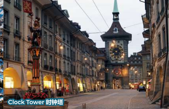
Clock Tower 时钟塔