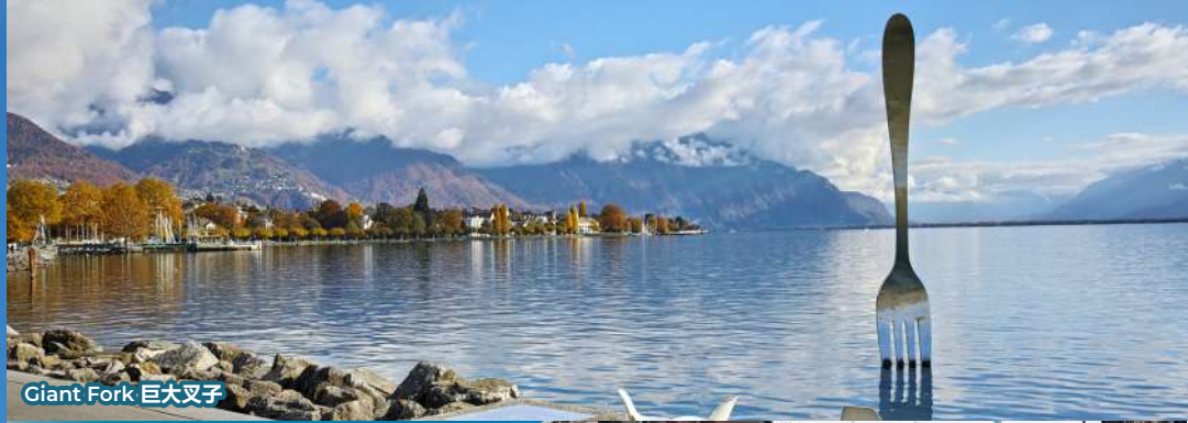
Giant Fork 巨大叉子