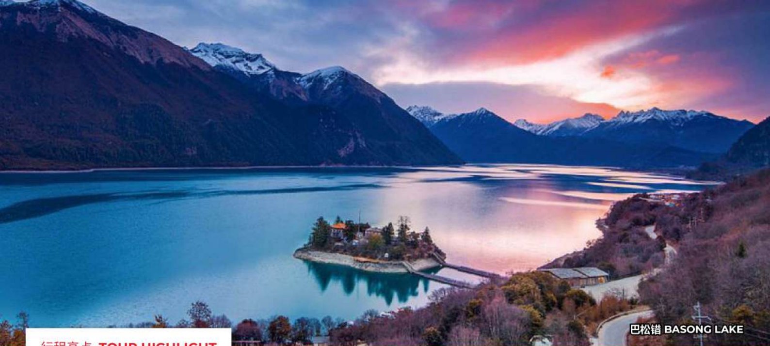
巴松错 BASONG LAKE