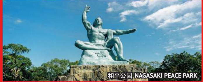
和平公园 NAGASAKI PEACE PARK