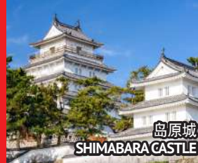
岛原城 SHIMABARA CASTLE