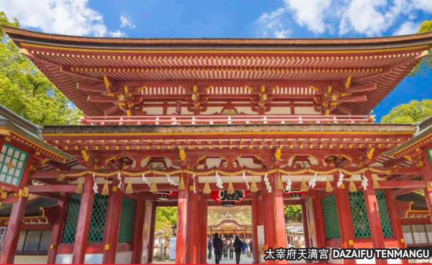
太宰府天满宫 DAZAIFU TENMANGU