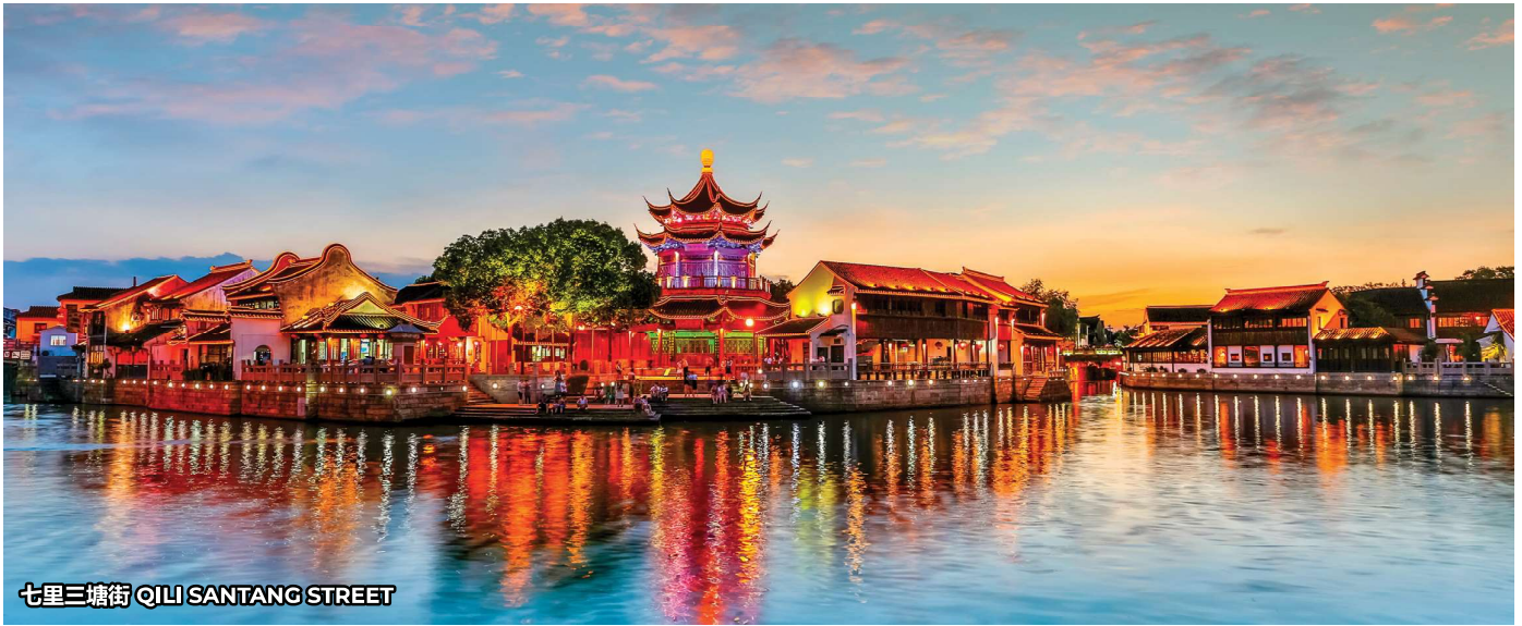
七里三塘街 QILI SANTANG STREET