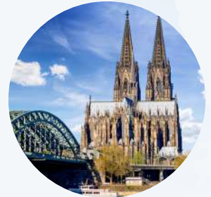
Cologne Cathedral 科隆大教堂

An open-air museum featuring historic windmills and traditional crafts, offering a charming glimpse into Dutch history.