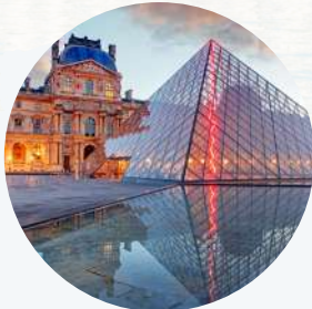
Louvre Museum 卢浮宫博物馆

Situated in the heart of Frankfurt, which offers a captivating blend of history and charm in the historic square with picturesque medieval architecture and iconic half-timbered houses.