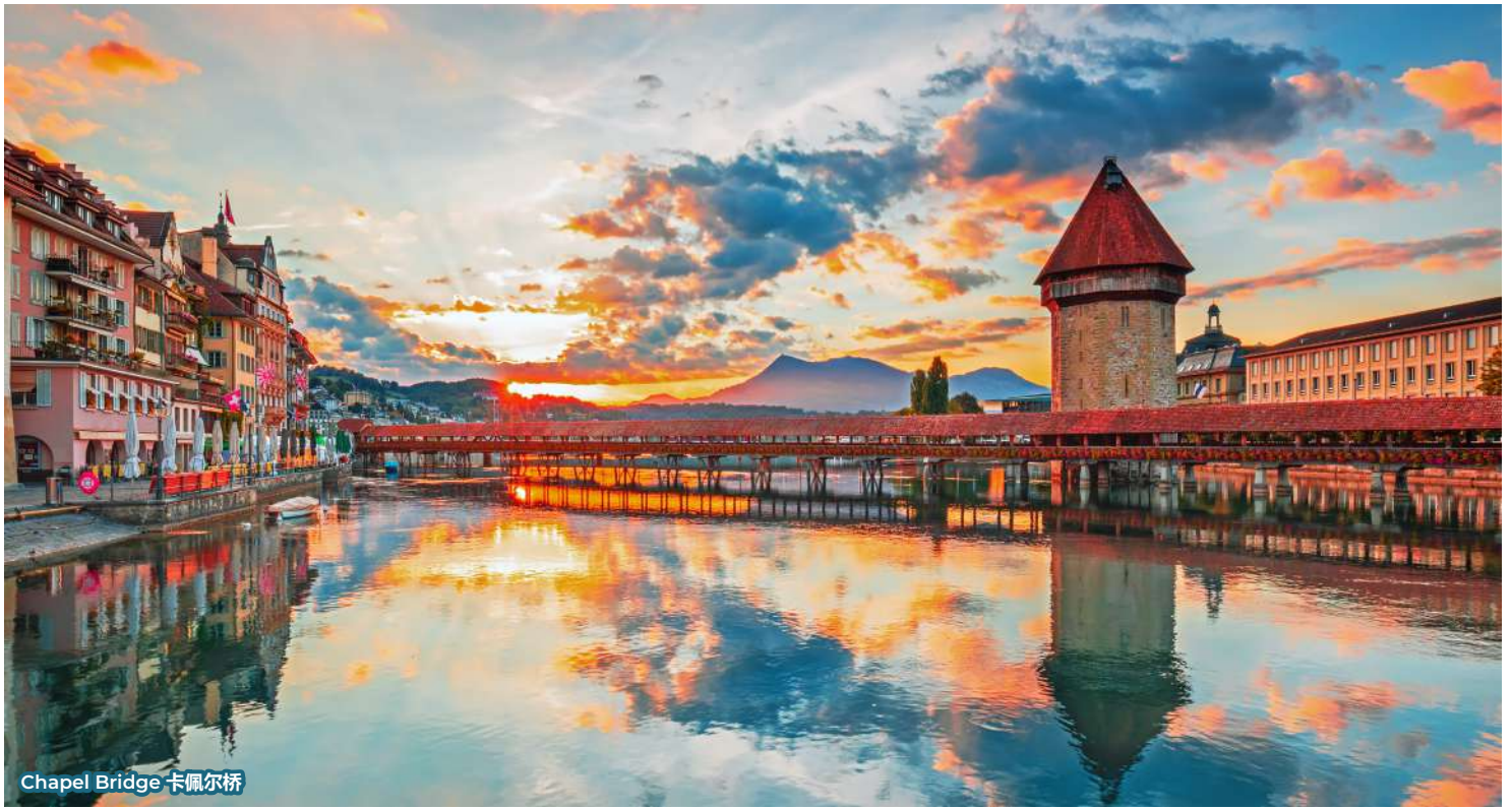
Chapel Bridge 卡佩尔桥