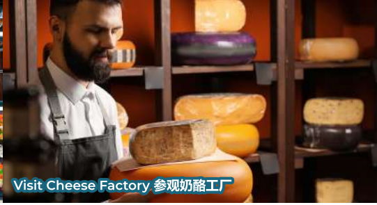
Visit Cheese Factory 参观奶酪工厂