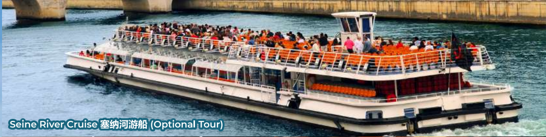
Seine River Cruise 塞纳河游船 (Optional Tour)