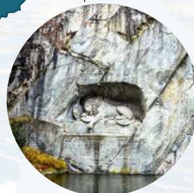
Lion Monument 狮子纪念碑

A historic palace turned art museum, showcasing a vast collection from ancient to contemporary times. Renowned works like the Mona Lisa make it a symbol of timeless human artistic achievement.