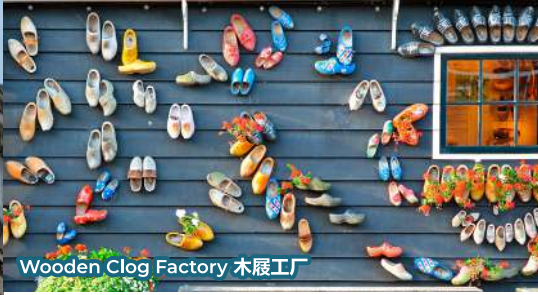
Wooden Clog Factory 木屐工厂