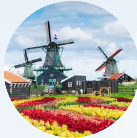
Zaanse Schans 风车村

An iconic symbol and museum, showcasing a magnified iron crystal. Built for the 1958 World's Fair, it represents scientific progress and modern architecture.