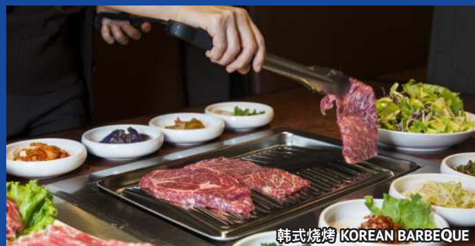
韩式烧烤 KOREAN BARBEQUE