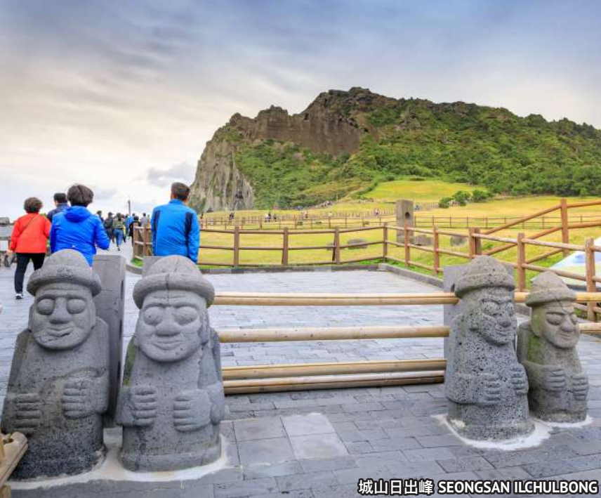
城山日出峰 SEONGSAN ILCHULBONG