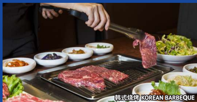
韩式烧烤 KOREAN BARBEQUE