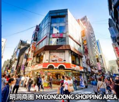
明洞商圈 MYEONGDONG SHOPPING AREA