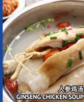
人参鸡汤 GINSENG CHICKEN SOUP