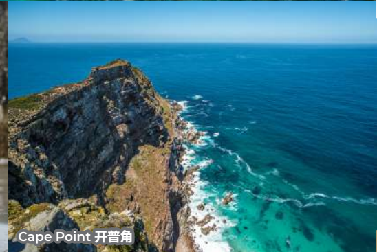
Cape Point 开普角