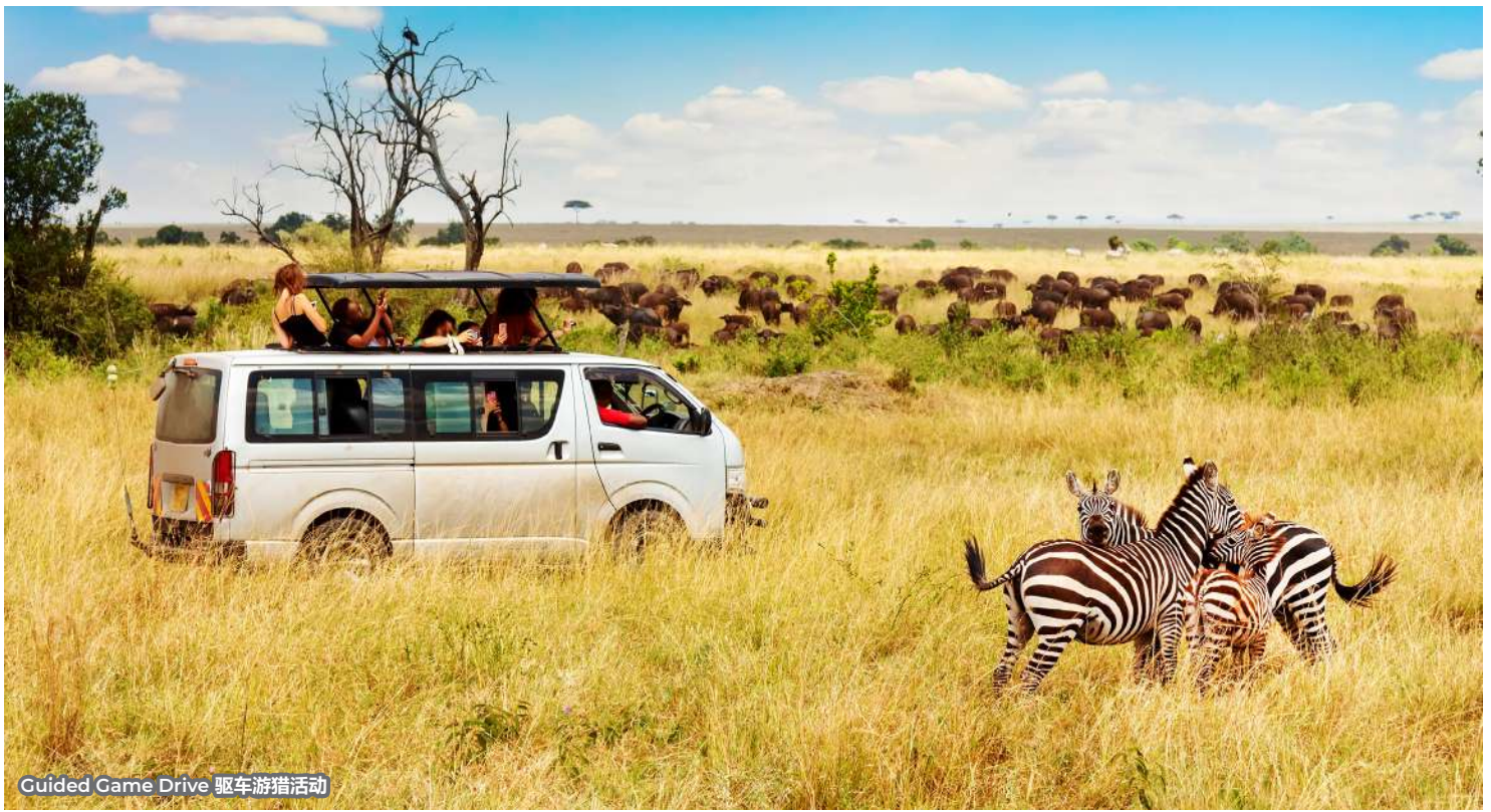
Guided Game Drive 驱车游猎活动