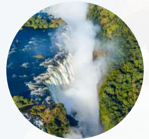
Victoria Falls 维多利亚瀑布

Victoria Falls is a waterfall on the Zambezi River in southern Africa, which provides habitat for several unique species of plants and animals.