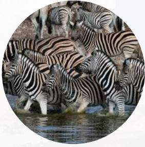
Chobe National Park 乔贝国家公园

Little Venice is a charming part of Mykonos. The water lapping up on the building is reminiscent of Venice.