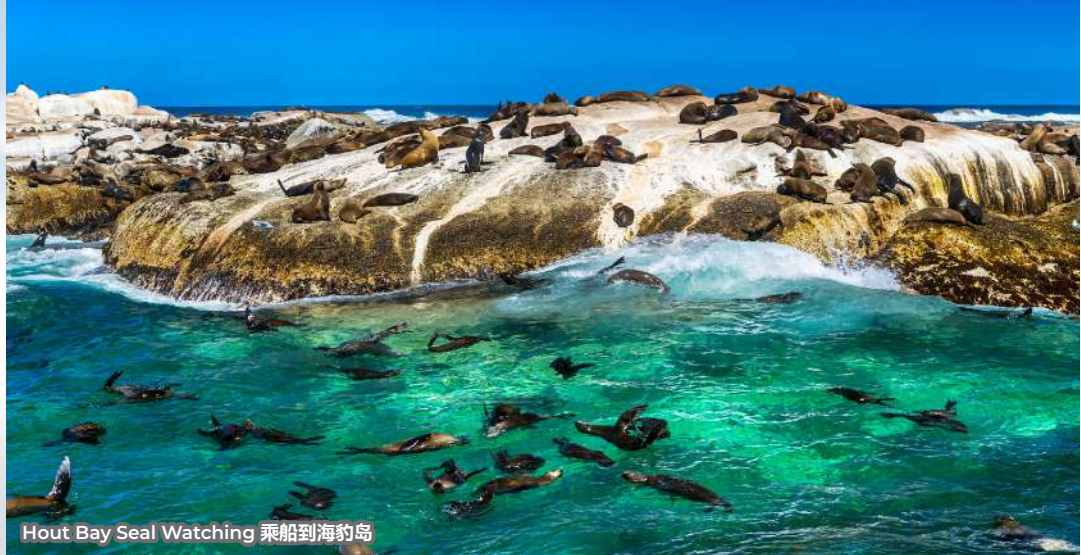
Hout Bay Seal Watching 乘船到海豹岛