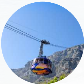
Cable Car Ride to Table Mountain 乘坐缆车登桌山

Victoria Falls is a waterfall on the Zambezi River in southern Africa, which provides habitat for several unique species of plants and animals.