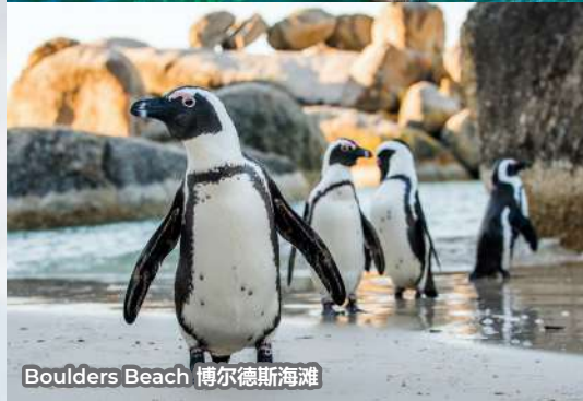
Boulders Beach 博尔德斯海滩