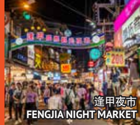
逢甲夜市 FENGJIA NIGHT MARKET