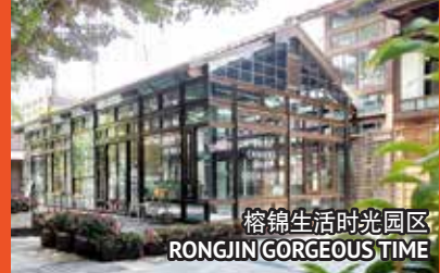
榕锦生活时光园区 RONGJIN GORGEOUS TIME