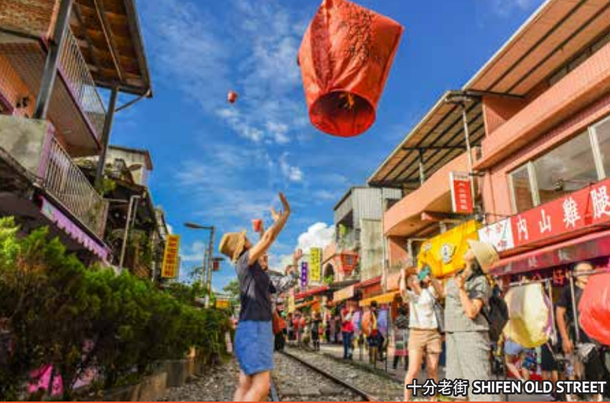
十分老街 SHIFEN OLD STREET