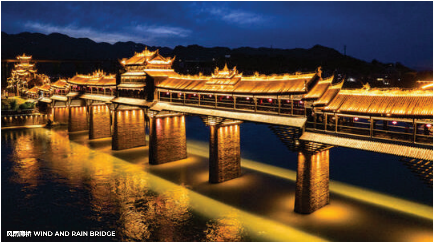
风雨廊桥 WIND AND RAIN BRIDGE