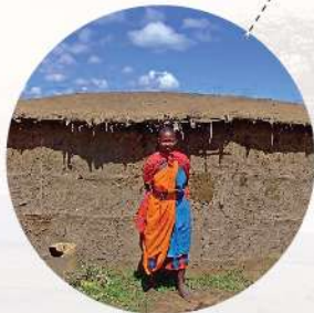
Maasai Village 马赛村

Arguably the most iconic tribal group in all of Africa, the Maasai, who populate vast areas of Southern areas of Kenya are the dominant ethnic group surrounding the Masai Mara. This nomadic, warrior tribe which once held vast swathes of pre colonial Kenya, still retain many of their traditions as they live largely untouched by modern day civilization, in areas surrounding Masai Mara.