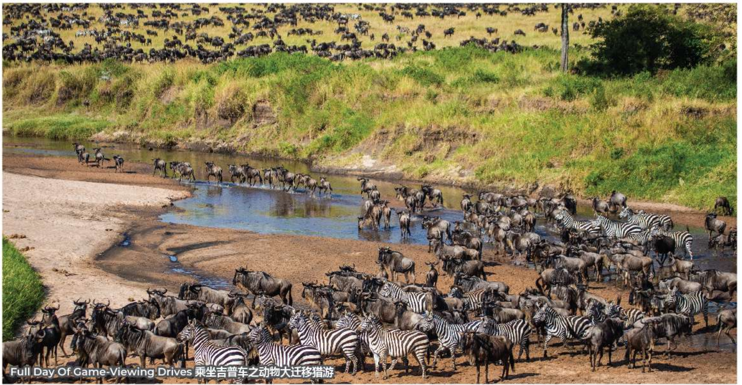
Full Day Of Game-Viewing Drives 乘坐吉普车之动物大迁移狩猎