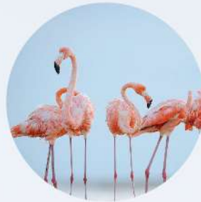
View lesser flamingoes 埃尔门泰塔湖

The smallest flamingo in the world, with a dark bill and red legs. Note glowing red eyes in adults. Juveniles are gray-brown and darker than young Greater Flamingos. Found in alkaline lakes and coastal lagoons, where gathers in huge flocks to eat microscopic blue-green algae. Breeds on remote flats sheltered from predators. Migrates and breeds in response to changing environmental conditions.