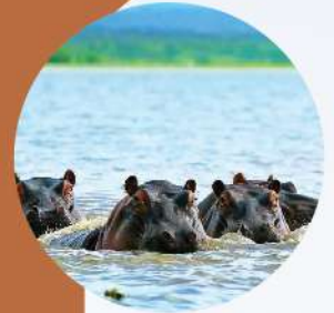
Crescent Island 新月岛

Lake Nakuru National Park is ideal for bird watching, hiking, picnic and game drives.