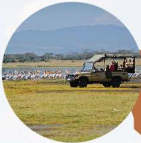
Game Drive in Lake Nakuru National Park 吉普车去探索野生动物

The smallest flamingo in the world, with a dark bill and red legs. Note glowing red eyes in adults. Juveniles are gray-brown and darker than young Greater Flamingos. Found in alkaline lakes and coastal lagoons, where gathers in huge flocks to eat microscopic blue-green algae. Breeds on remote flats sheltered from predators. Migrates and breeds in response to changing environmental conditions.