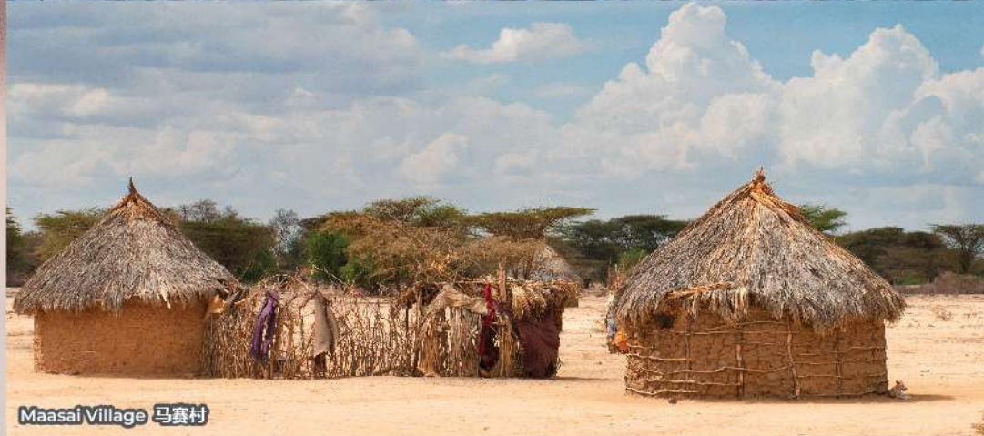
Maasai Village 马赛村