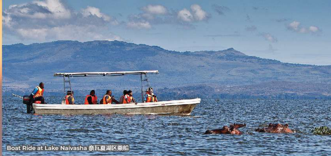
Boat Ride at Lake Naivasha 奈瓦夏湖区乘船