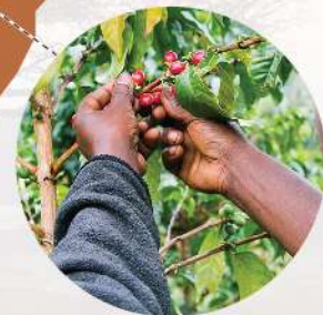
Coffee Plantation 咖啡种植园

Arguably the most iconic tribal group in all of Africa, the Maasai, who populate vast areas of Southern areas of Kenya are the dominant ethnic group surrounding the Masai Mara. This nomadic, warrior tribe which once held vast swathes of pre colonial Kenya, still retain many of their traditions as they live largely untouched by modern day civilization, in areas surrounding Masai Mara.