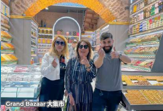
Grand Bazaar 大集市