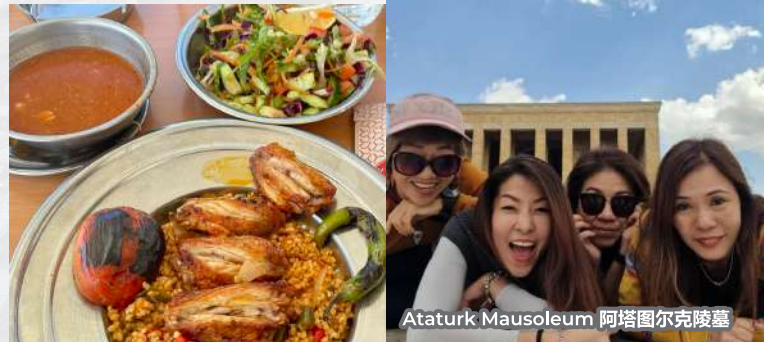
Ataturk Mausoleum 阿塔图尔克陵墓