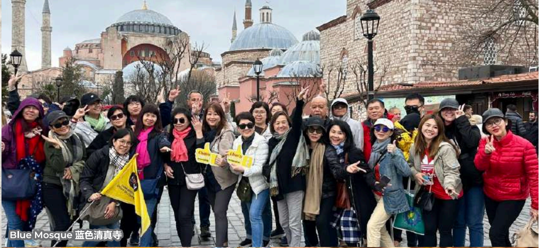
Blue Mosque 蓝色清真寺