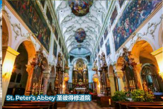
St. Peter's Abbey 圣彼得修道院