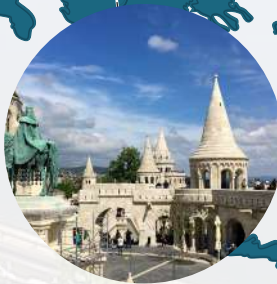
Fisherman's Bastion 渔人堡

Vienna's imperial residence with stunning gardens, a UNESCO site, and rich history.