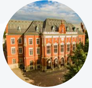
Jagiellonian University 雅盖隆大学

Iconic fortress with stunning architecture, overlooking Prague's skyline and the Vltava River.