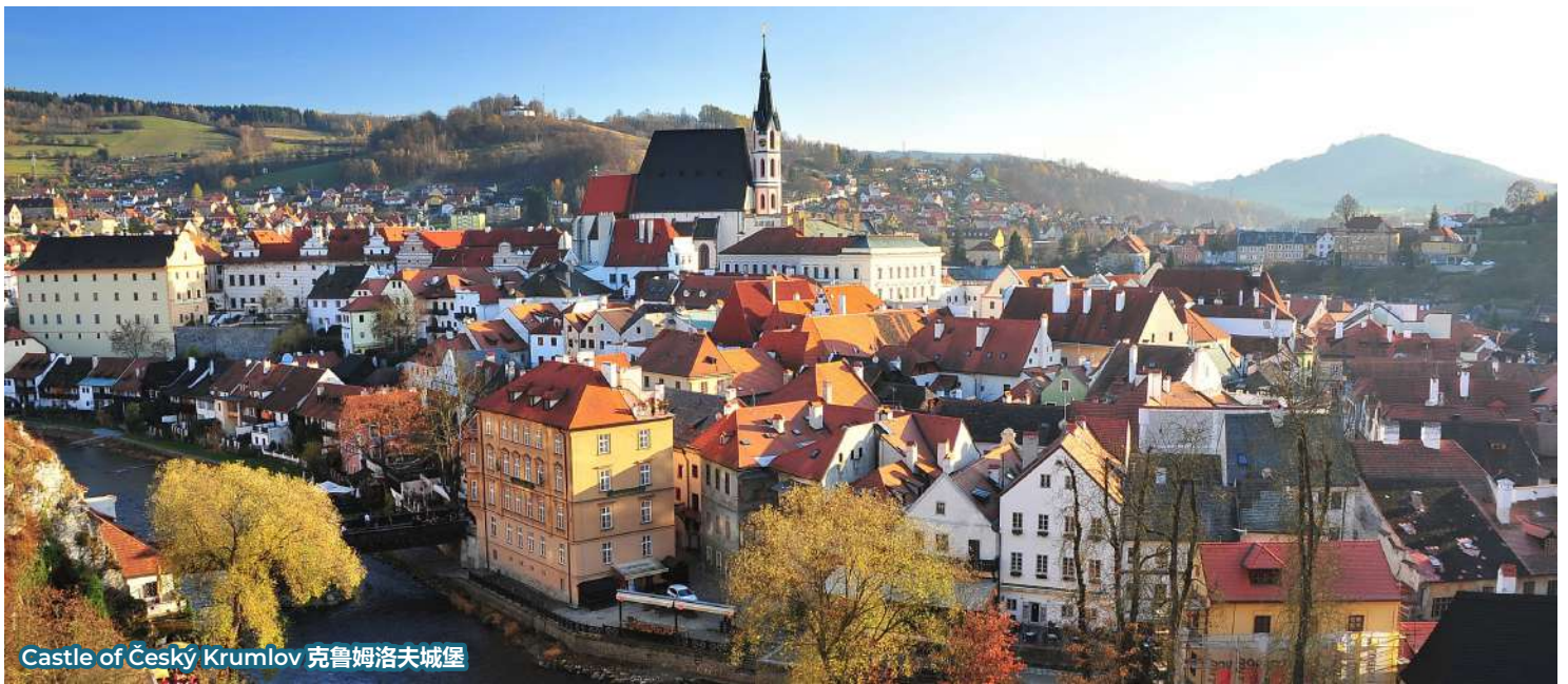
Castle of Český Krumlov 克鲁姆洛夫城堡