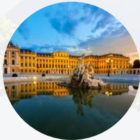
Schonbrunn Palace 美泉宫

Vienna's imperial residence with stunning gardens, a UNESCO site, and rich history.