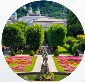
Mirabell Garden 米拉贝尔花园

Poland's oldest university, renowned for academic excellence and historic significance in Kraków.