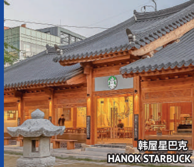
韩屋星巴克 HANOK STARBUCK