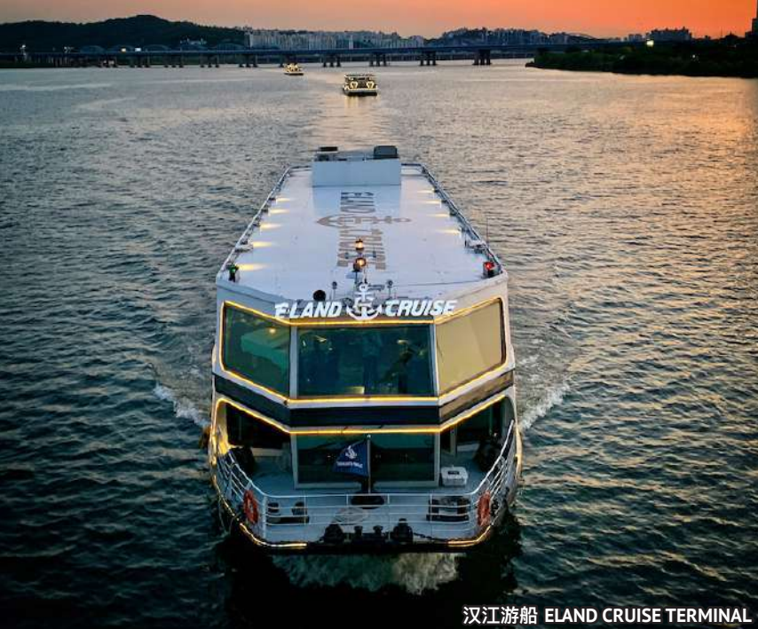
汉江游船 ELAND CRUISE TERMINAL