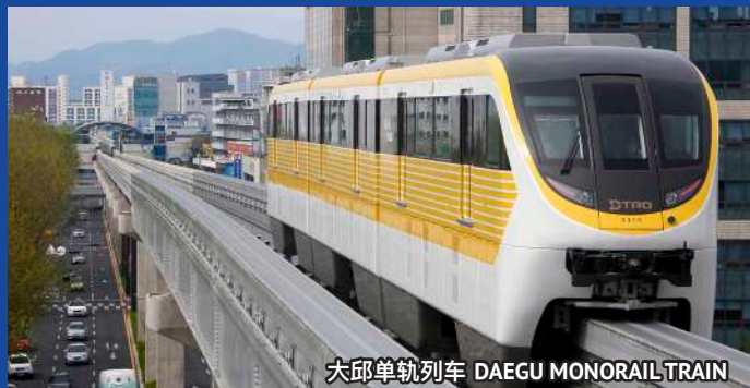
大邱单轨列车 DAEGU MONORAIL TRAIN