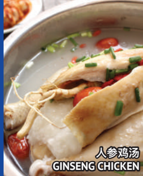
人参鸡汤 GINSENG CHICKEN