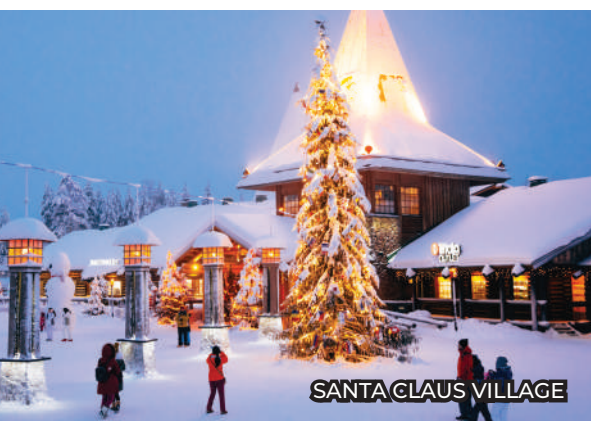
SANTA CLAUS VILLAGE