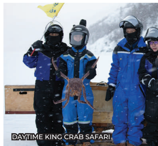
DAYTIME KING CRAB SAFARI

Note: Amethyst Pendolino ride is subject to suitable weather conditions and will be replaced with a short walk up to Lampivaara hill if unavailable Northern Lights is a natural phenomenon and sighting is subject to weather conditions