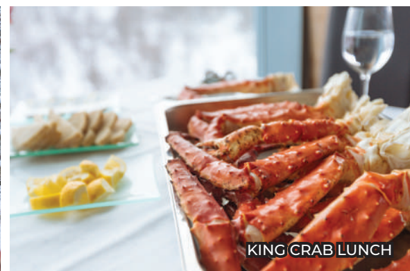
KING CRAB LUNCH