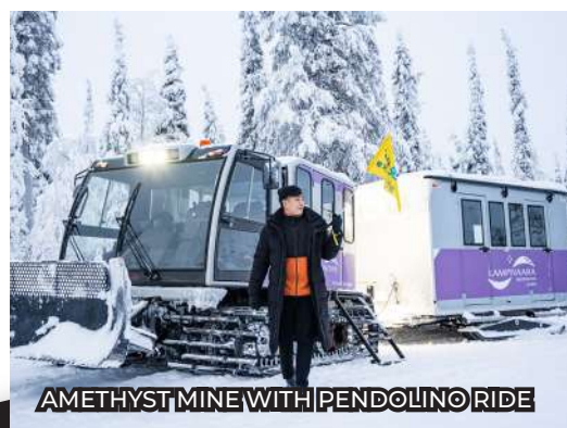
AMETHYST MINE WITH PENDOLINO RIDE