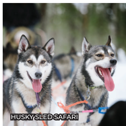
HUSKY SLED SAFARI