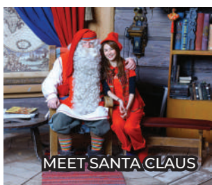
MEET SANTA CLAUS