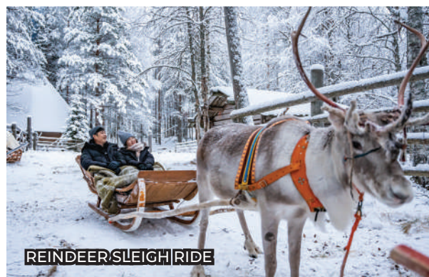
REINDEER SLEIGH RIDE