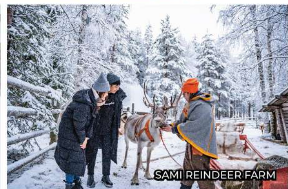
SAMI REINDEER FARM

This morning, embark on a city tour to discover the city's architectural masterpiece, Arctic Cathedral . Head to Tromso Cathedral , one of the largest wooden cathedrals in Norway built in the Gothic Revival style. Take the Fjellheisen cable car ride up to Mt Storsteinen , for a panoramic view of Tromso.