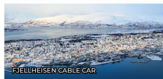
FJELLHEISEN CABLE CAR