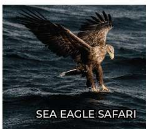
SEA EAGLE SAFARI