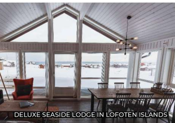
DELUXE SEASIDE LODGE IN LOFOTEN ISLANDS

If time permits, you can do some last-minute shopping before you transfer to the airport for your flight home.