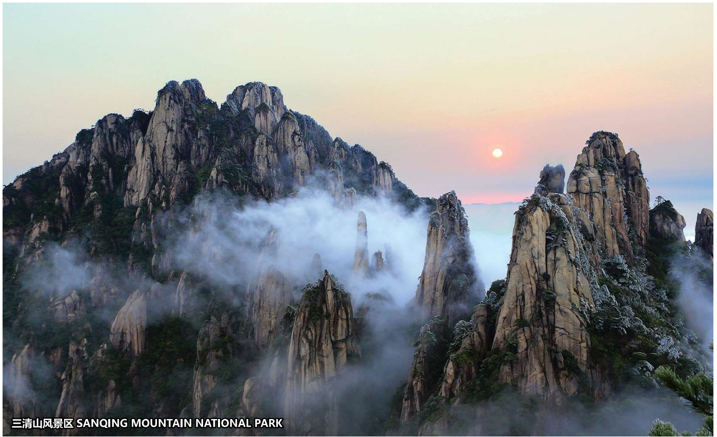
三清山风景区 SANQING MOUNTAIN NATIONAL PARK