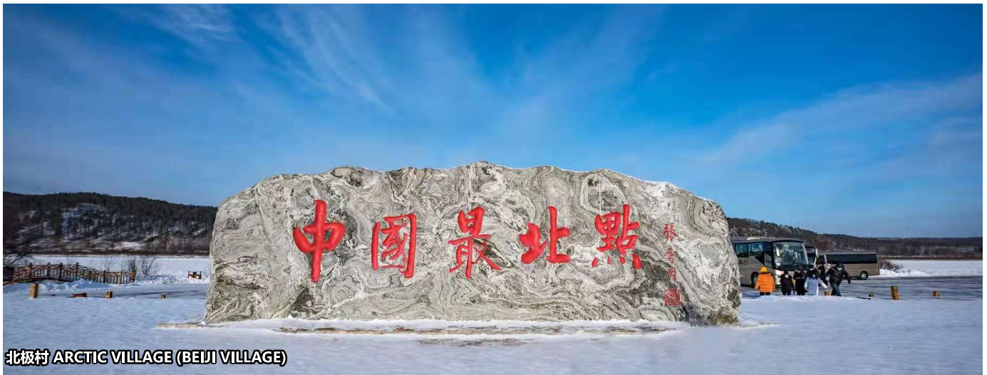
北极村 ARCTIC VILLAGE (BEIJI VILLAGE)