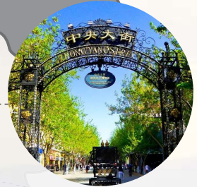
中央大街 Zhongyang Pedestrian Street

黑龙江扎龙国家级自然保护区是我国以鹤类等大型水禽为主的珍稀水禽分布区，是世界上最大的丹顶鹤繁殖地。