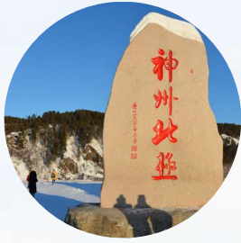
北极沙洲风景区 Arctic Sandbar Scenic Area

位于黑龙江省漠河市，黑龙江上游南岸，与俄罗斯阿穆尔州隔江相望，是中国最北的旅游景区，素有“神州北极”之美称。