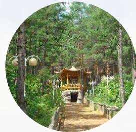
栖霞山植物园 Qixia Mountain Botanical Garden

位于黑龙江省漠河市，黑龙江上游南岸，与俄罗斯阿穆尔州隔江相望，是中国最北的旅游景区，素有“神州北极”之美称。