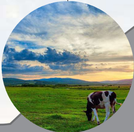
呼伦贝尔大草原 Hulunbeier Grassland

呼伦贝尔草原位于内蒙古自治区东北部，地处大兴安岭以西的呼伦贝尔高原上，因呼伦湖、贝尔湖而得名。