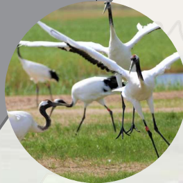
扎龙自然保护区 Zhalong Nature Reserve in Qiqihar

呼伦贝尔草原位于内蒙古自治区东北部，地处大兴安岭以西的呼伦贝尔高原上，因呼伦湖、贝尔湖而得名。