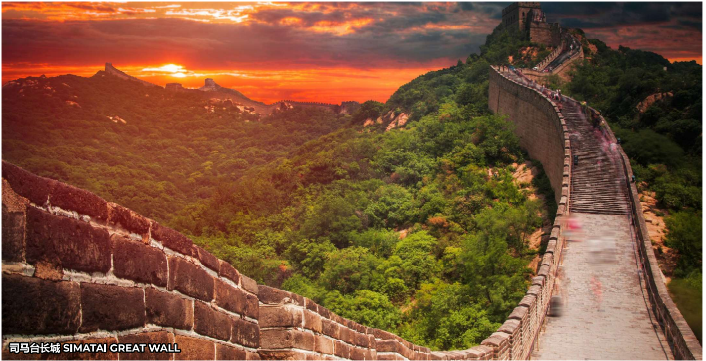
司马台长城 SIMATAI GREAT WALL