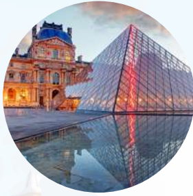
Louvre Museum 卢浮宫博物馆

A historic palace turned art museum, showcasing a vast collection from ancient to contemporary times. Renowned works like the Mona Lisa make it a symbol of timeless human artistic achievement.