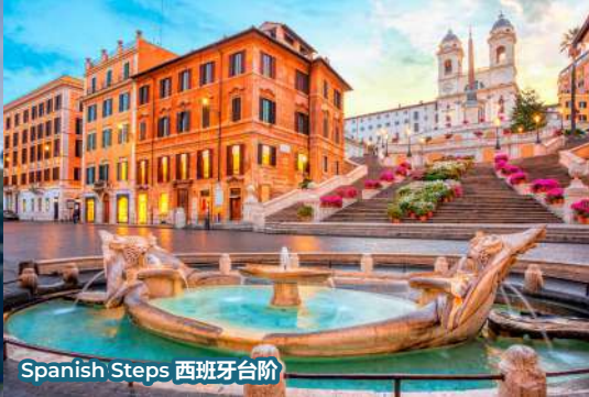
Spanish Steps 西班牙台阶