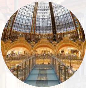
Galleria Vittorio Emanuele II 埃马努埃莱二世拱廊

Often called the "Top of Europe," offers breathtaking views of the Swiss Alps from its high-altitude railway station.