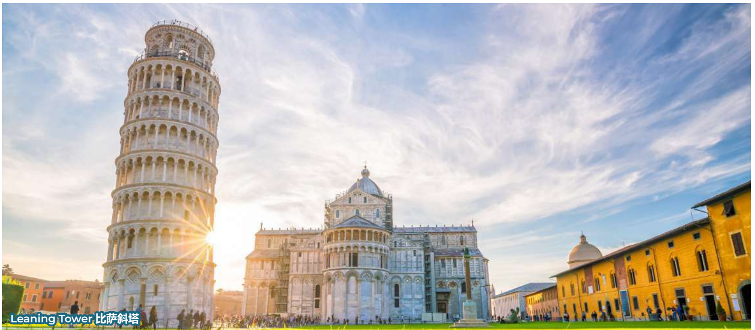
Leaning Tower 比萨斜塔