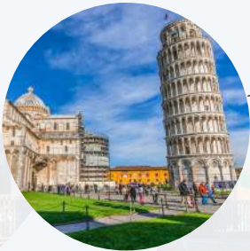
Leaning Tower Pisa 比萨斜塔

A premier shopping haven surrounded by the beauty of the Italian countryside.