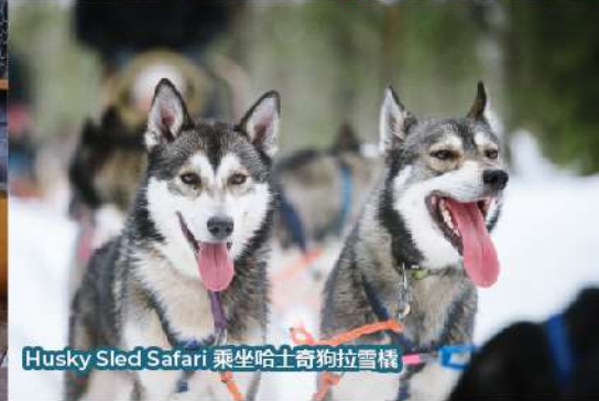
Husky Sled Safari 乘坐哈士奇狗拉雪橇