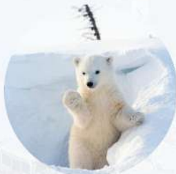
Ranua Wildlife Park

Meet the local reindeers up close, learn about their role in Sami culture, and enjoy a peaceful reindeer sleigh ride through the mesmerizing Arctic landscape.