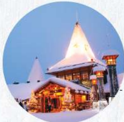
Santa Claus Village

After a day of exploring, take some time to stroll through the charming village, where you'll find cozy cafés, local boutiques, and charming shops offering traditional Finnish souvenirs.