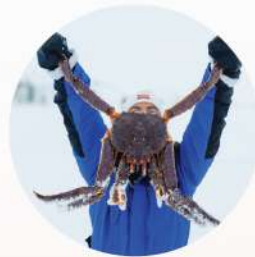
King Crab Safari

The Amethyst Mine atop Lampivaara Hill offers a unique opportunity to mine your own amethyst in the heart of Lapland. Located in Luosto, this scenic spot is surrounded by the breathtaking beauty of Pyhä-Luosto National Park.