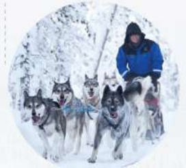
Husky Sled Safari

Embark on the ultimate king crab safari, where you will journey across the frozen fjord on a snowmobile sleigh ride and learn how to catch this giant king crab. After which, enjoy a scrumptious king crab lunch.