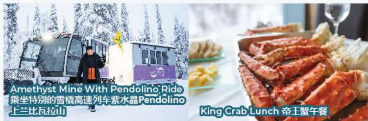
Amethyst Mine With Pendolino Ride 乘坐特别的雪橇高速列车紫水晶 Pendolino 上兰比瓦拉山