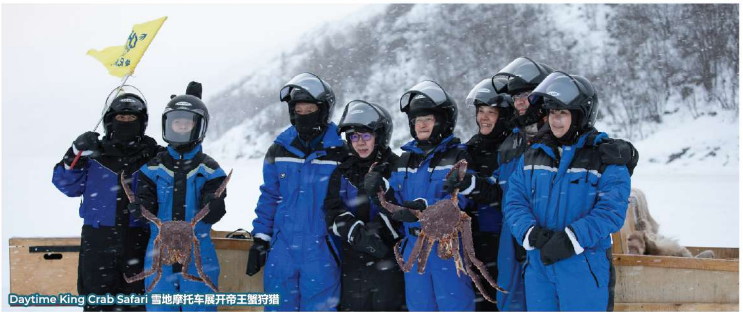
Daytime King Crab Safari 雪地摩托车展开帝王蟹狩猎