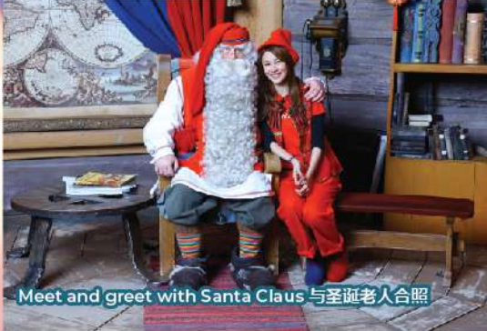
Meet and greet with Santa Claus 与圣诞老人合照