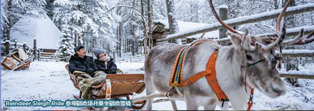
Reindeer Sleigh Ride 参观驯鹿场并乘坐驯鹿雪橇