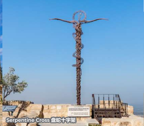
Serpentine Cross 盘蛇十字架