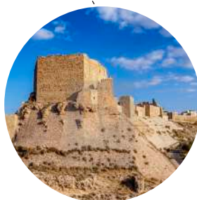
Karak Castle 卡拉克城堡

Petra is a horse ride from the main gate to the top of the Siq.