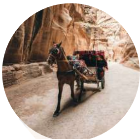
Horseback ride to Siq 骑马至锡克峡谷

Rainbow Street, originally named Abu Bakr al Siddiq street, is a public space in the historic area of Jabal Amman, near the center of downtown Amman, Jordan.