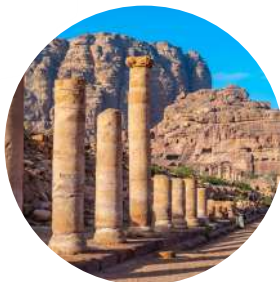
Colonnaded Street 柱廊式街道

This rather modest 19th-century Greek Orthodox church houses a treasure of early Christianity. Imagine the excitement in 1884 when Christian builders came across the remnants of a Byzantine church on their construction site.