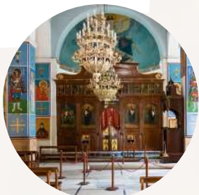
Greek Orthodox Church of St George 圣·佐治希腊正教教堂

This rather modest 19th-century Greek Orthodox church houses a treasure of early Christianity. Imagine the excitement in 1884 when Christian builders came across the remnants of a Byzantine church on their construction site.