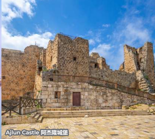
Ajlun Castle 阿杰隆城堡