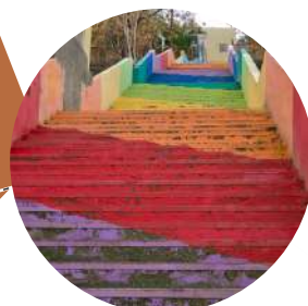
Rainbow Street 彩虹街

Rainbow Street, originally named Abu Bakr al Siddiq street, is a public space in the historic area of Jabal Amman, near the center of downtown Amman, Jordan.