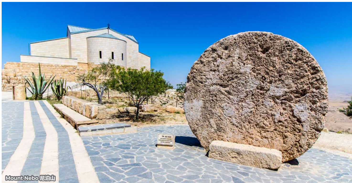
Mount Nebo 尼泊山