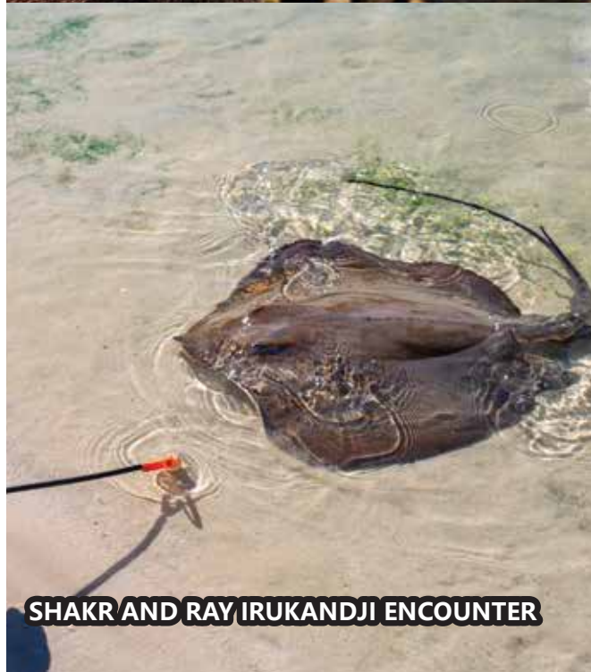
SHAKR AND RAY IRUKANDJI ENCOUNTER