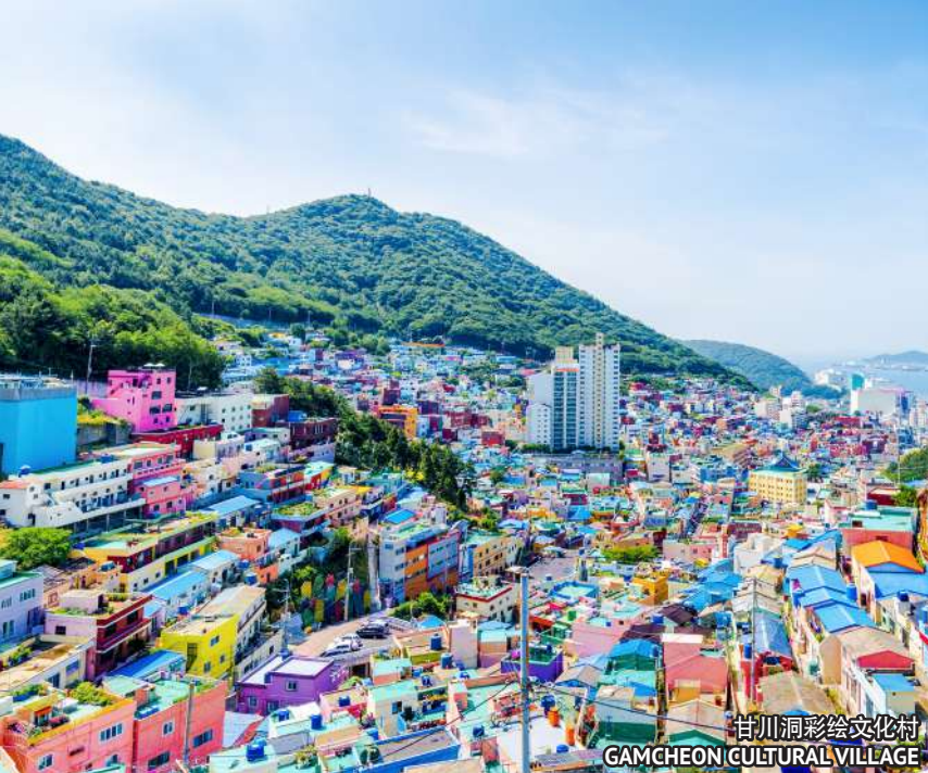
甘川洞彩繪文化村 GAMCHEON CULTURAL VILLAGE