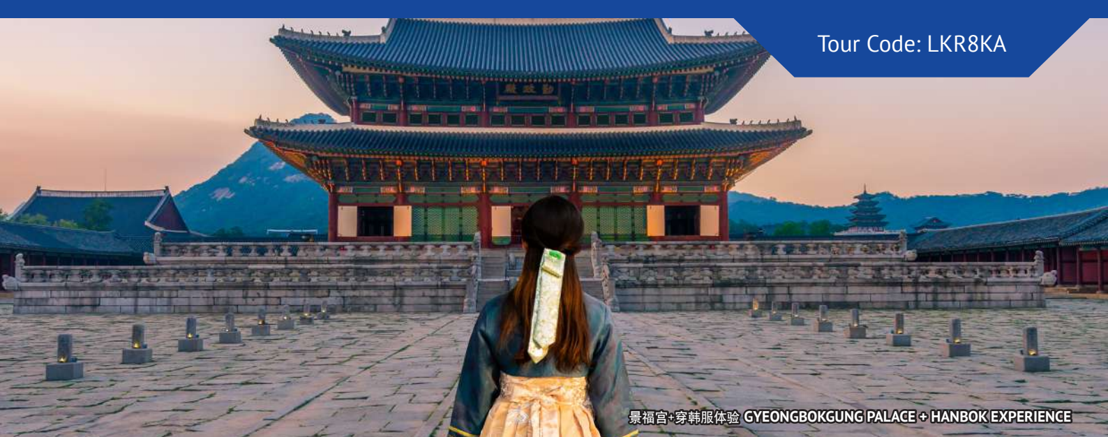
景福宫+穿韩服体验 GYEONGBOKGUNG PALACE + HANBOK EXPERIENCE