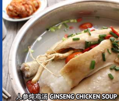
人蔘炖鸡汤 GINSENG CHICKEN SOUP