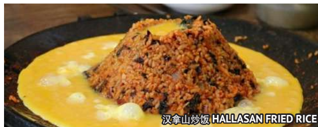
汉拿山炒饭 HALLASAN FRIED RICE