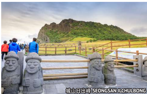
城山日出峰 SEONGSAN ILCHULBONG