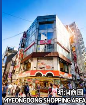
明洞商圈 MYEONGDONG SHOPPING AREA