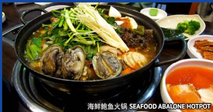
海鮮鮑魚火鍋 SEAFOOD ABALONE HOTPOT