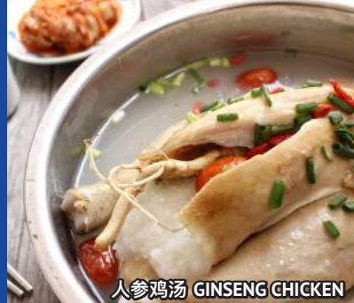
人参鸡汤 GINSENG CHICKEN