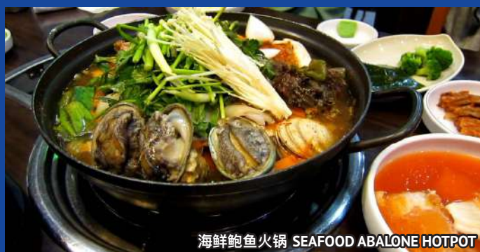
海鲜鲍鱼火锅 SEAFOOD ABALONE HOTPOT