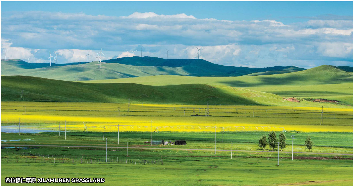
希拉穆仁草原 XILAMUREN GRASSLAND