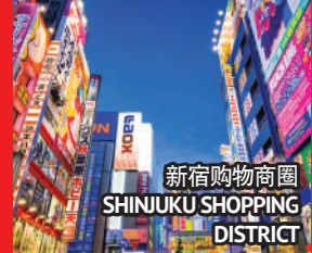
新宿购物商圈 SHINJUKU SHOPPING DISTRICT