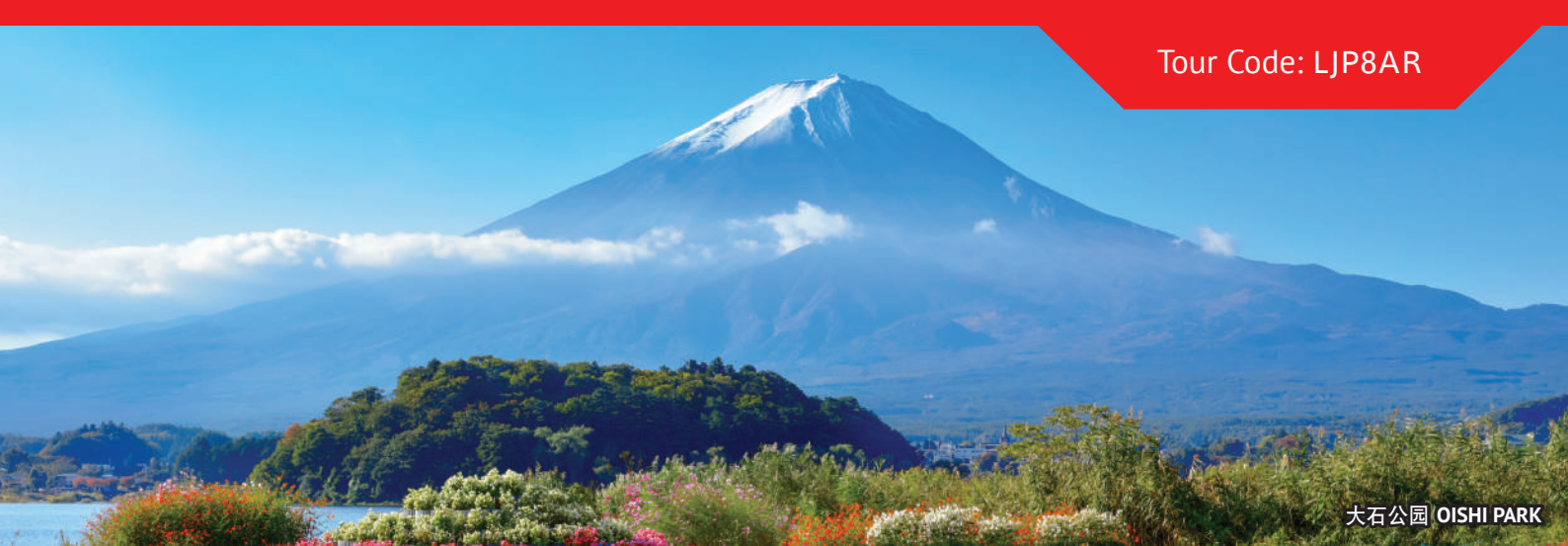
大石公园 OISHI PARK