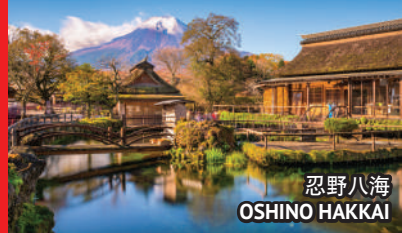
忍野八海 OSHINO HAKKA