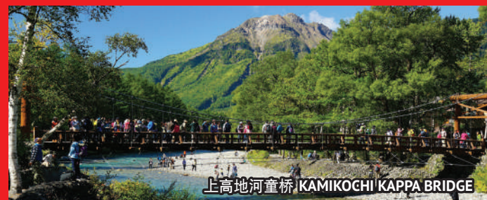
上高地河童桥 KAMIKOCHI KAPPA BRIDGE