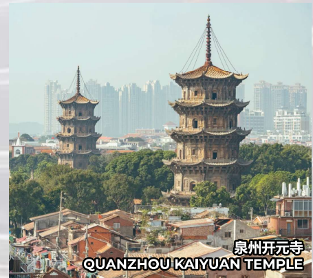
泉州开元寺 QUANZHOU KAIYUAN TEMPLE