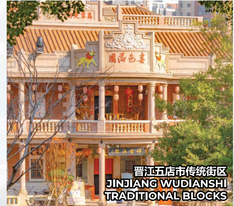
晋江五店市传统街区 JINJIANG WUDIANSHI TRADITIONAL BLOCKS

Hotel: Chaozhou Linjiang Hotel or Similar*