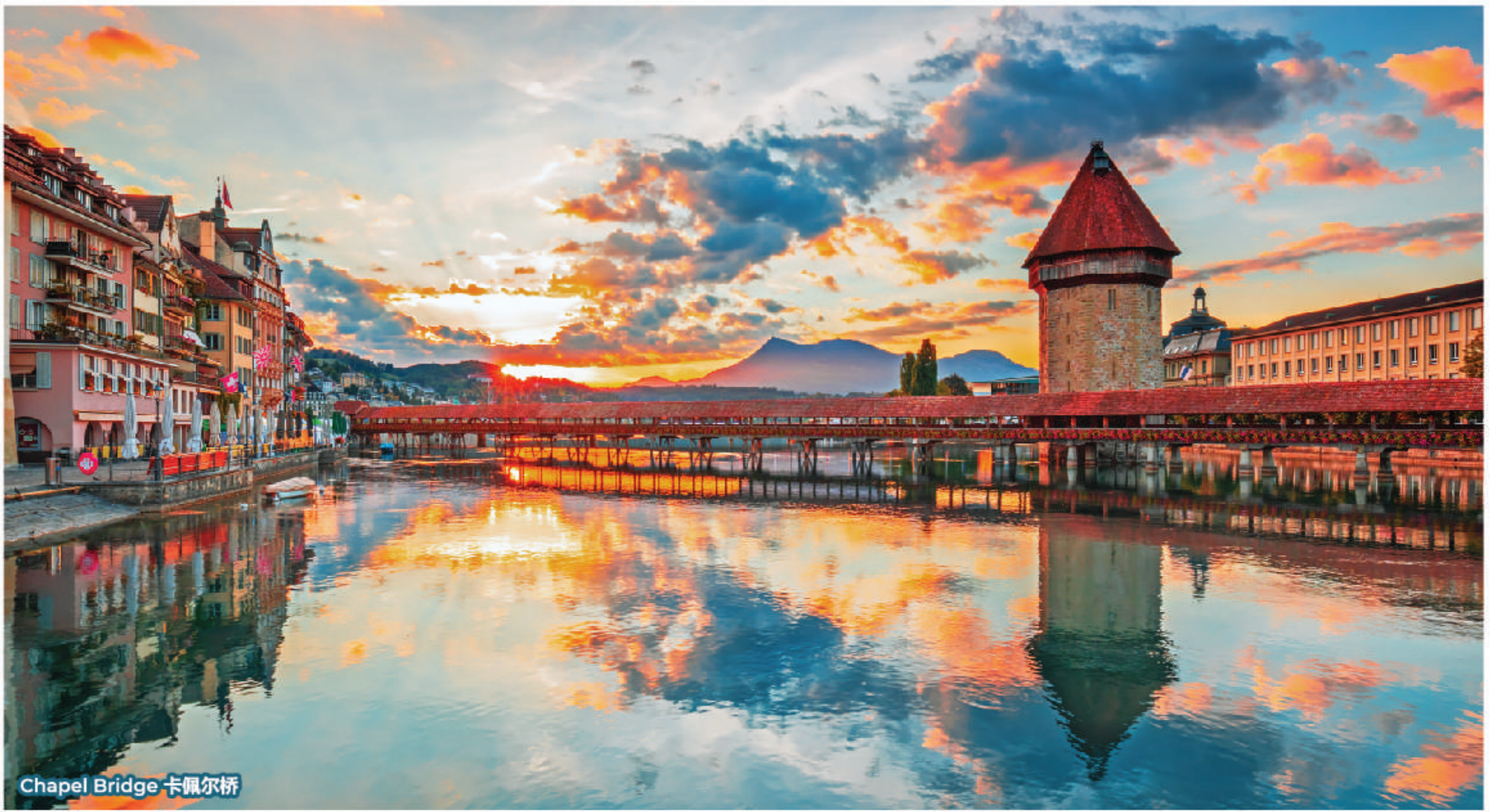
Chapel Bridge 卡佩尔桥