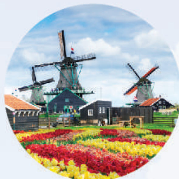
Zaanse Schans 风车村

An iconic symbol and museum, showcasing a magnified iron crystal. Built for the 1958 World's Fair, it represents scientific progress and modern architecture.