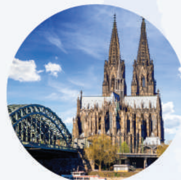
Cologne Cathedral 科隆大教堂

An open-air museum featuring historic windmills and traditional crafts, offering a charming glimpse into Dutch history.