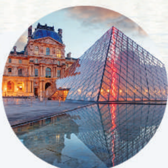
Louvre Museum 卢浮宫博物馆

Situated in the heart of Frankfurt, which offers a captivating blend of history and charm in the historic square with picturesque medieval architecture and iconic half-timbered houses.