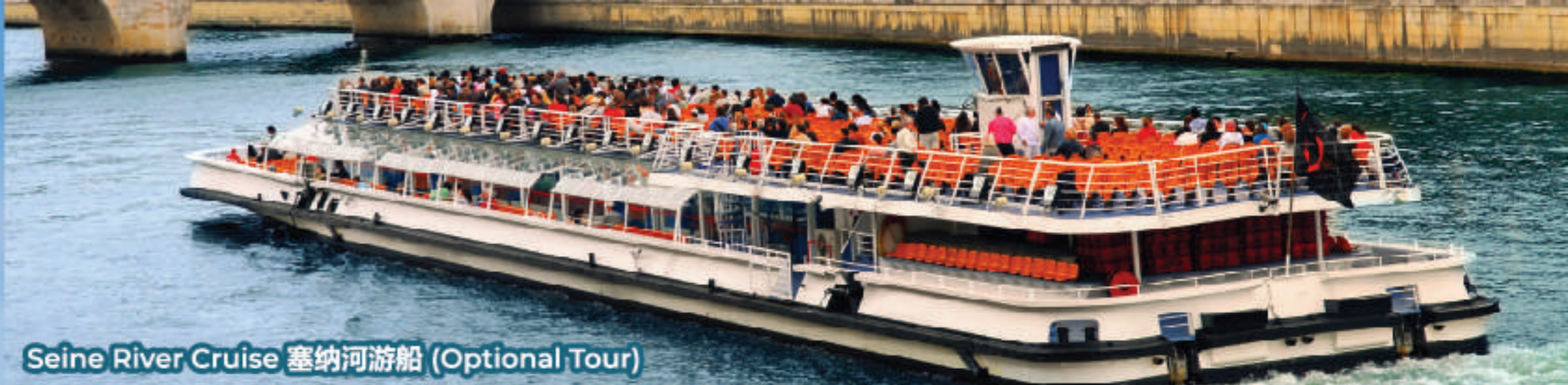
Seine River Cruise 塞纳河游船 (Optional Tour)