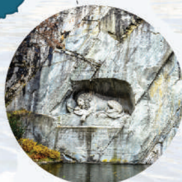
Lion Monument 狮子纪念碑

A historic palace turned art museum, showcasing a vast collection from ancient to contemporary times. Renowned works like the Mona Lisa make it a symbol of timeless human artistic achievement.