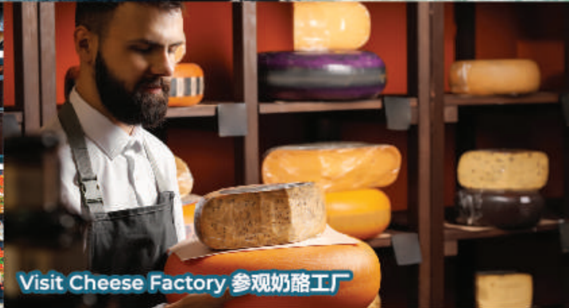
Visit Cheese Factory 参观奶酪工厂