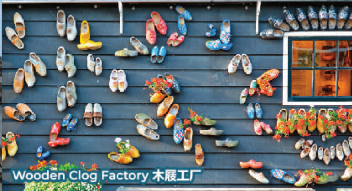
Wooden Clog Factory 木屐工厂