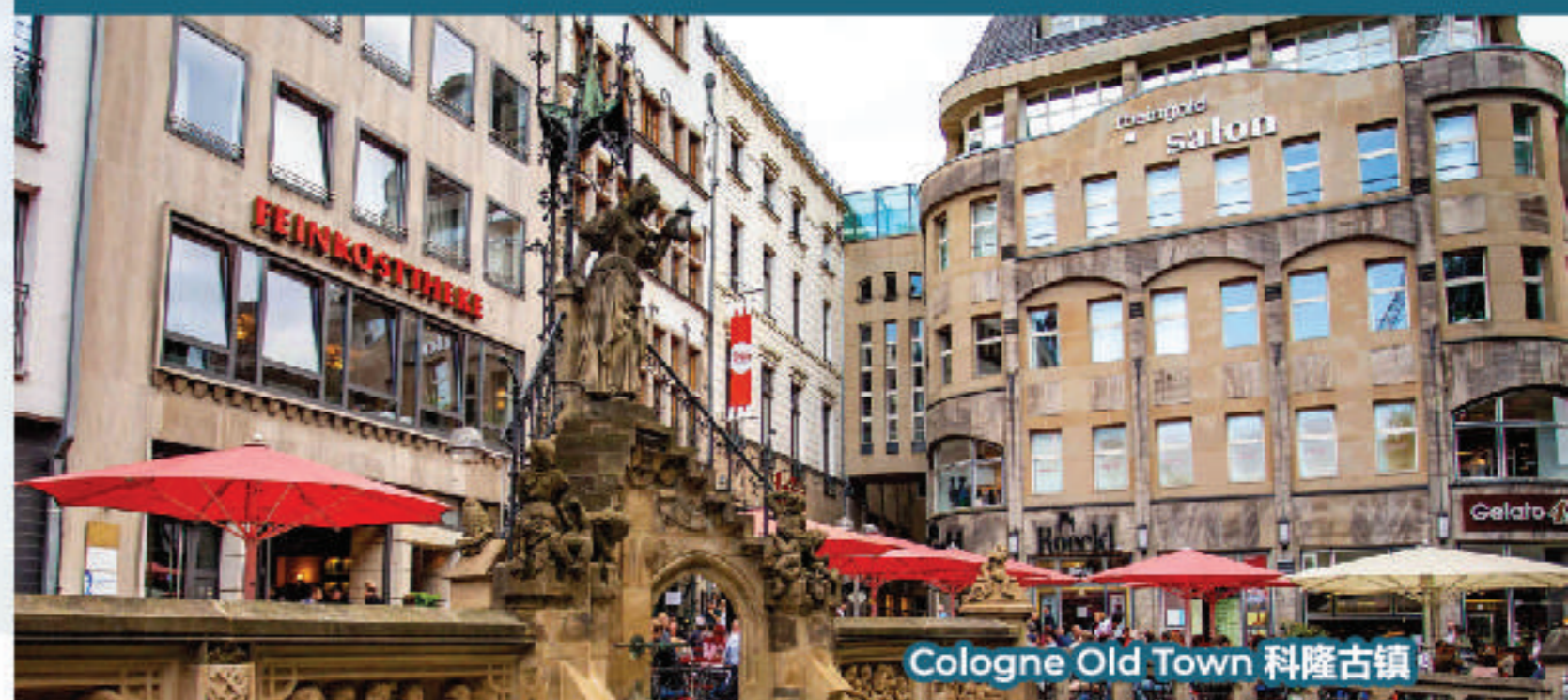
Cologne Old Town 科隆古镇