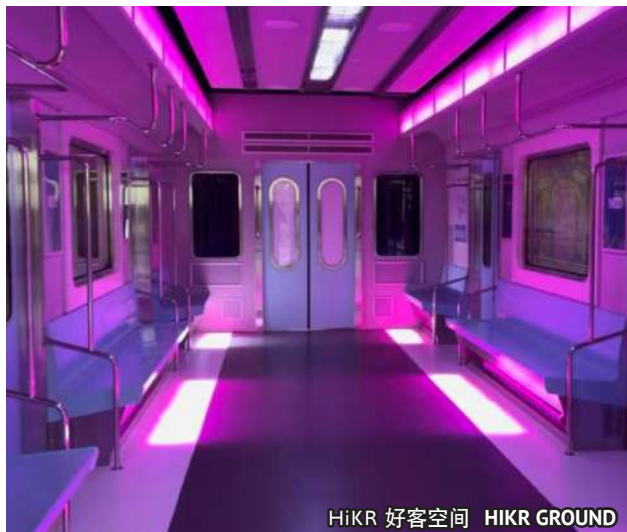
HiKR 好客空间 HiKR GROUND