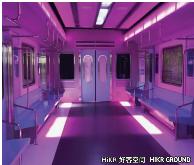
HiKR 好客空间 HiKR GROUND