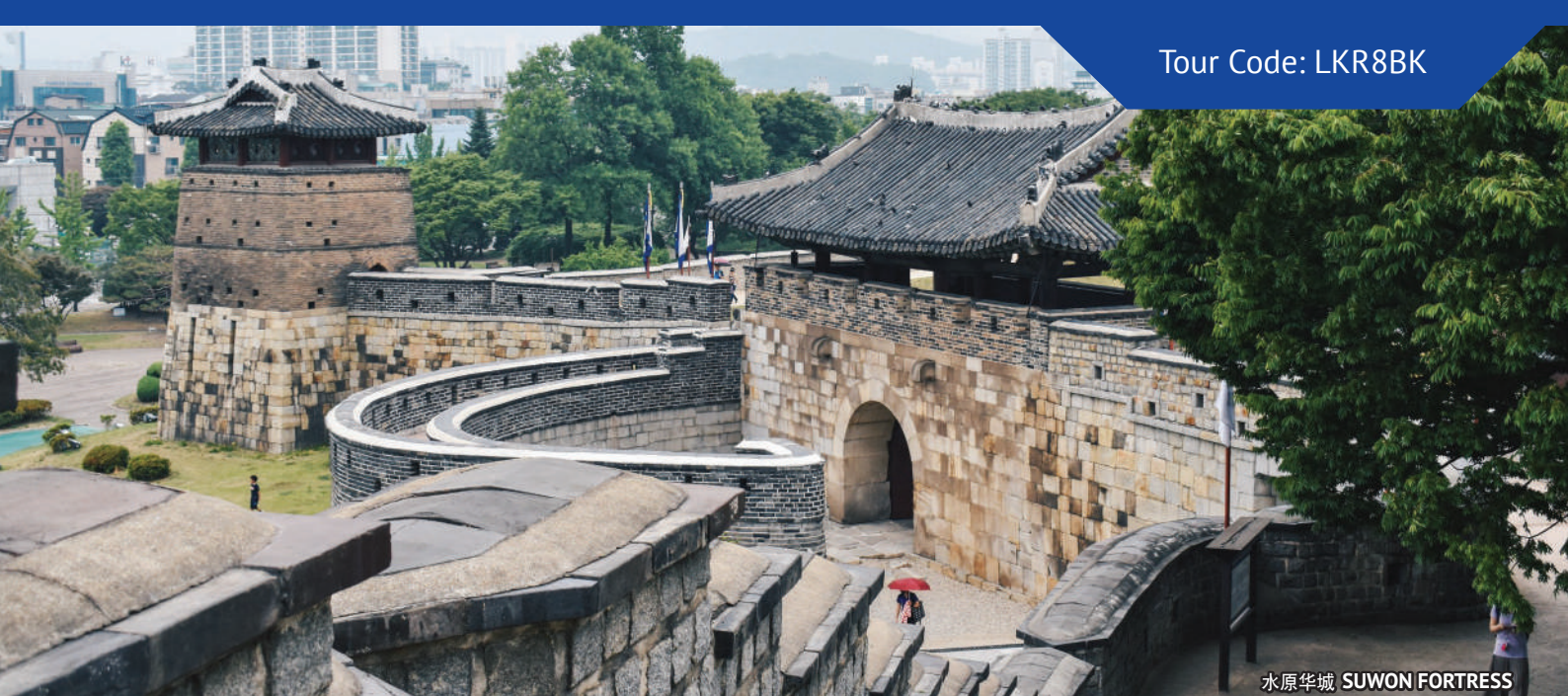
水原华城 SUWON FORTRESS