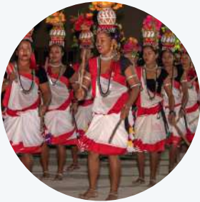
Tharu Cultural Performance 塔鲁文化表演

The Temple of the Sacred Tooth Relic, or Sri Dalada Maligawa, is a Buddhist temple in Kandy, Sri Lanka. It is located in the royal palace complex of the former Kingdom of Kandy, which houses the relic of the tooth of the Buddha.