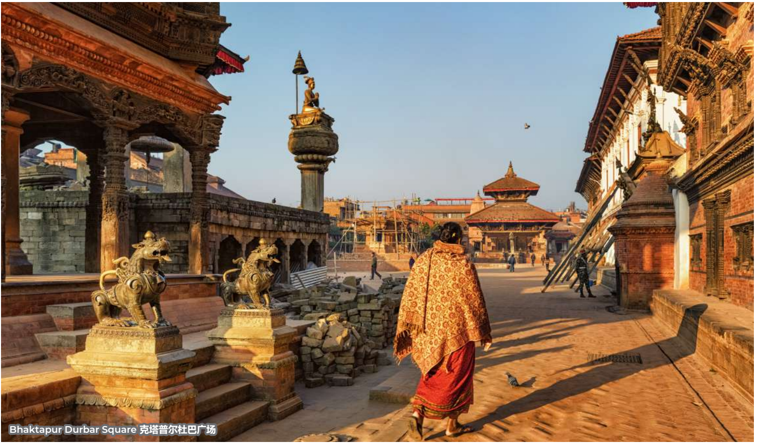
Bhaktapur Durbar Square 克塔普尔杜巴广场