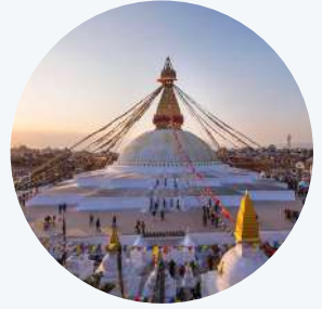
Great Stupa of Boudhanath 博拿佛塔

The Temple of the Sacred Tooth Relic, or Sri Dalada Maligawa, is a Buddhist temple in Kandy, Sri Lanka. It is located in the royal palace complex of the former Kingdom of Kandy, which houses the relic of the tooth of the Buddha.