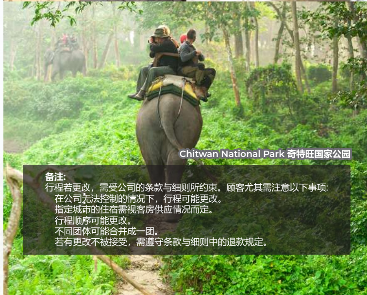
Chitwan National Park 奇特旺国家公园