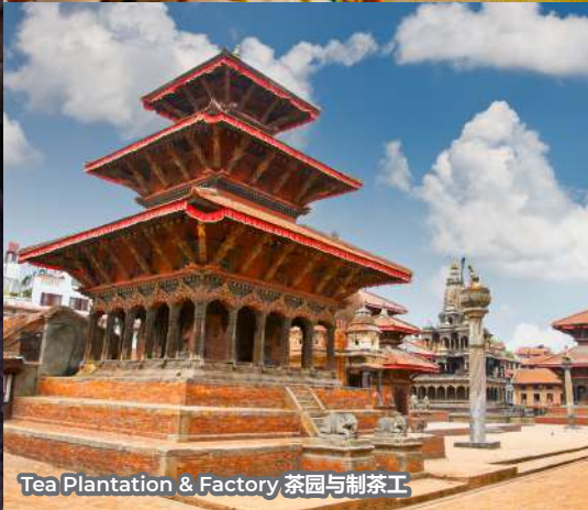
Tea Plantation & Factory 茶园与制茶工