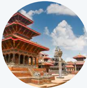
Bhaktapur Durbar Square 巴克塔普尔杜巴广场

The Temple of the Sacred Tooth Relic, or Sri Dalada Maligawa, is a Buddhist temple in Kandy, Sri Lanka. It is located in the royal palace complex of the former Kingdom of Kandy, which houses the relic of the tooth of the Buddha.