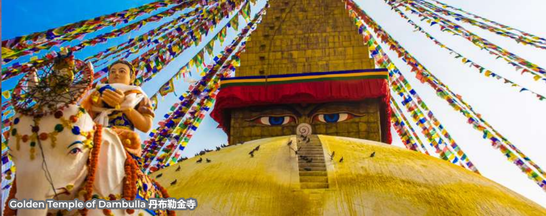
Golden Temple of Dambulla 丹布勒金寺