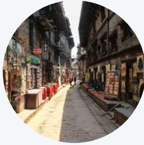
Thamel Street 塔美街

The Temple of the Sacred Tooth Relic, or Sri Dalada Maligawa, is a Buddhist temple in Kandy, Sri Lanka. It is located in the royal palace complex of the former Kingdom of Kandy, which houses the relic of the tooth of the Buddha.