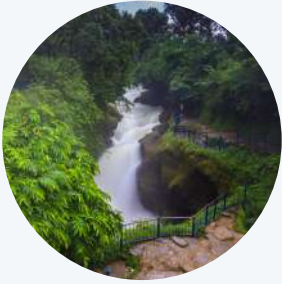
Devi's Fall 戴维斯瀑布

The Temple of the Sacred Tooth Relic, or Sri Dalada Maligawa, is a Buddhist temple in Kandy, Sri Lanka. It is located in the royal palace complex of the former Kingdom of Kandy, which houses the relic of the tooth of the Buddha.