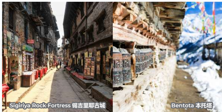
Sigiriya Rock Fortress 锡吉里耶古城