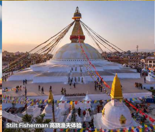
Stilt Fisherman 高跷渔夫体验