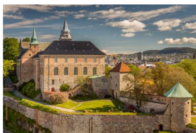
▪ Akershus Fortress

Today, make your journey towards the Sognefjord region, Norway’s longest and deepest fjord. Stop by Briksdal , if time and weather permits, you may wish to join an optional troll car excursion to Briksdal Glacier. Hop on to the unique troll cars which brings you to the stand about 700 metres away from the glacier. Here, you can enjoy a nice stroll to the glacier, into Jostedal Glacier National Park. Continue your journey through Fjaeland . Tonight, spend your night in a fjord hotel at Sognefjord region.