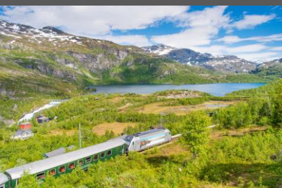
▪ Flam Railways