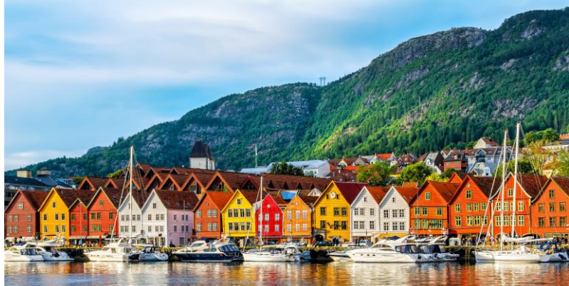
▪ Bryggen, Bergen