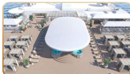
CONCIERGE POOL & SUNDECK

Exact amenities and layout may vary slightly depending on stateroom location and category.