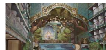
Disney Imagination Garden